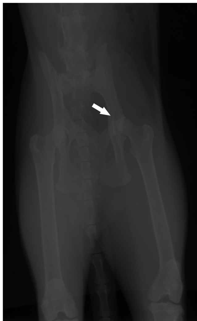
FIGURE 2 Left hip joint. Acetabular sclerosis and mild periosteal reaction on the cranial edge of the acetabulum, which could suggest incipient degenerative (white arrow).

Following radiographic examination, blood samples were obtained and submitted for CBC and biochemical analysis. The results showed an elevated alkaline phosphatase (ALP) of 107 IU/L. The remaining values were within normal limits for the species (Table 1). Due to haemolysis in the EDTA tube, it was not possible to perform a CBC