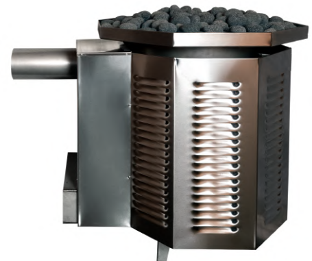
Model 280 80,000 BTU