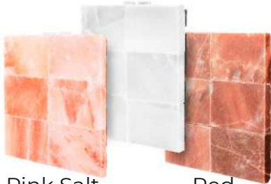
Pink Salt Panel