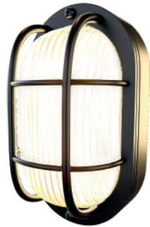
Oval Sauna Light