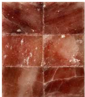
Red Salt Panels