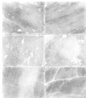
White Salt Panels