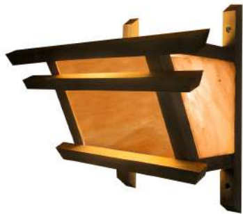
Himalayan Salt Sconce

Perfect lighting inside the sauna is crucial in generating