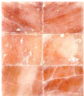
Pink Salt Panels

Create beautiful patterns with our Himalayan Salt Panels and enjoy their 84 naturally occurring minerals and elements.