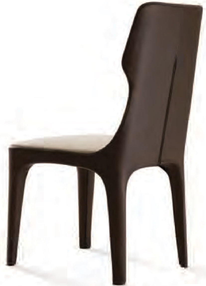
32 . 33