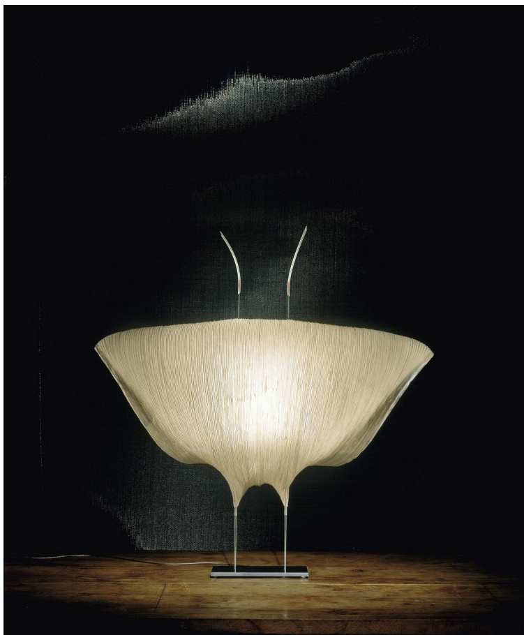
Samurai LED DAGMAR MOMBACH, INGO MAURER & TEAM 1998

Paper, metal, stainless steel, silicone, glass, glassfibre shades. Samurai LED is equipped with a dimmable LED module. The module was developed by Ingo Maurer GmbH especially for the MaMo Nouchies. The light is warm and soft, and can hardly be distinguished from conventional halogen light. In contrast to the halogen version shown in the photos, the cable is visible, as with Poul Poul.