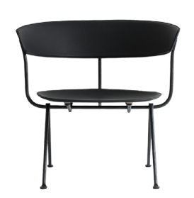
Frame: Black Seat and Back: Black Leather L-0060