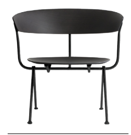
Frame: Black Seat and Back: Black Beech