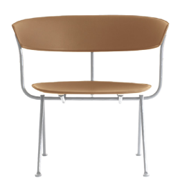
Frame: Galvanized Seat and Back: Natural Leather L-0090