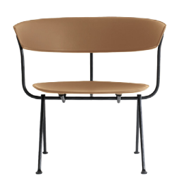
Frame: Black Seat and Back: Natural Leather L-0090