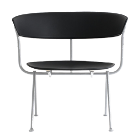
Frame: Galvanized Seat and Back: Black Leather L-0060