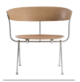
Frame: Galvanized Seat and Back: Natural Beech