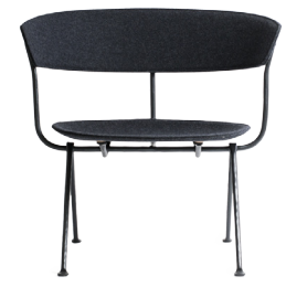
Frame: Black Seat and Back: Dark Grey Divina MD (193)