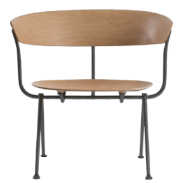
Frame: Black Seat and Back: Natural Beech