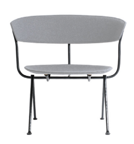
Frame: Black Seat and Back: Light Grey Divina Mélange 120