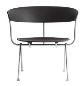
Frame: Galvanized Seat and Back: Black Beech