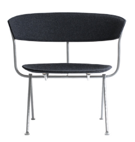
Frame: Galvanized Seat and Back: Dark Grey Divina MD (193)