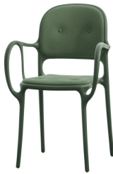
Matt colour Dark Green 1556 C Cushions: KingL green F-359