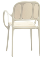
Matt colour Beige 1733 C Cushions: KingLKat beige F-459