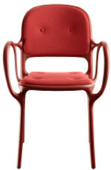
Matt colour Red 1484 C Cushions: KingLKat red F-130