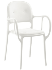
Matt colour White 1738 C Cushions: KingLKat white F-739