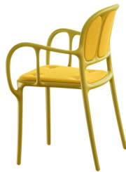
Matt colour Yellow 1666 C Cushions: KingLKat yellow F-579