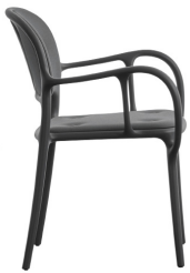
Matt colour Black 1769 C Cushions: KingL black F-198