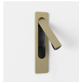
CODE: 1437021 FINISH: MATT GOLD