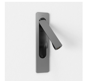
CODE: 1437024 FINISH: POLISHED CHROME

To maintain this product to its best condition, please view our care and cleaning guide on the support section of the astro website.