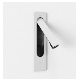
CODE: 1437023 FINISH: MATT WHITE