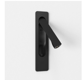
CODE: 1437020 FINISH: MATT BLACK