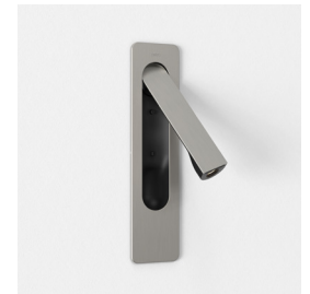
CODE: 1437022 FINISH: MATT NICKEL