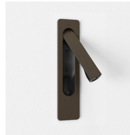
CODE: 1437019 FINISH: BRONZE