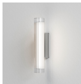
CODE: 1409001 FINISH: POLISHED CHROME