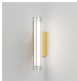
CODE: 1409006 FINISH: MATT GOLD

TO MAINTAIN THIS PRODUCT TO ITS BEST CONDITION, PLEASE VIEW OUR CARE AND CLEANING GUIDE ON THE SUPPORT SECTION OF THE ASTRO WEBSITE.