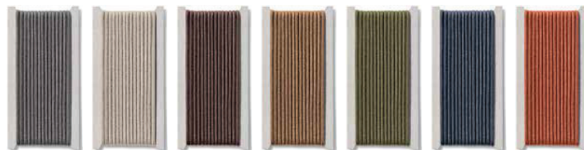
GREY SAND BROWN TOBACCO OLIVE BLUE ORANGE