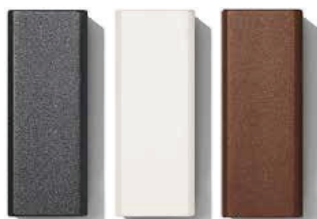
SMOKE MILK RUST