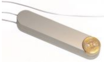
Flat power supply with integrated dimmer