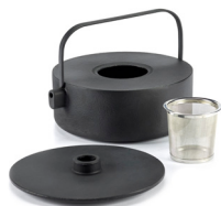
Tea Pot Cast-Iron Giel B6819103 1,2l