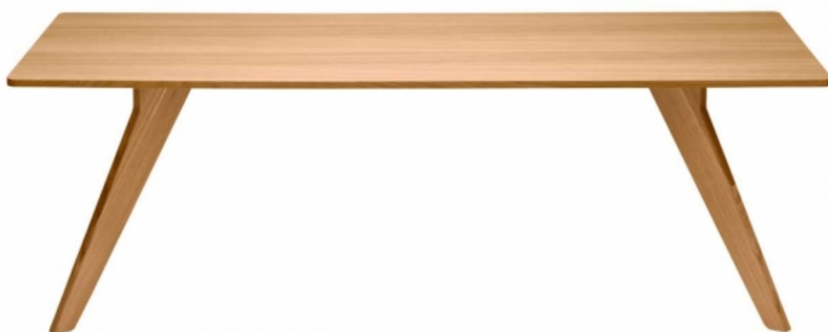
Table with structure composed by legs in lacquered oak solid wood natural or dark coloured or colored stains and stove enameled steel frame. Rectangular top in glass (extra light, bronze or sapphire) or in mdf oak veneered with solid wood edge with finish in natural or dark lacquered oak or colored stains finish. Dimension: 180x80 cm / 200x90 cm / 220x90 cm / 240x100 cm