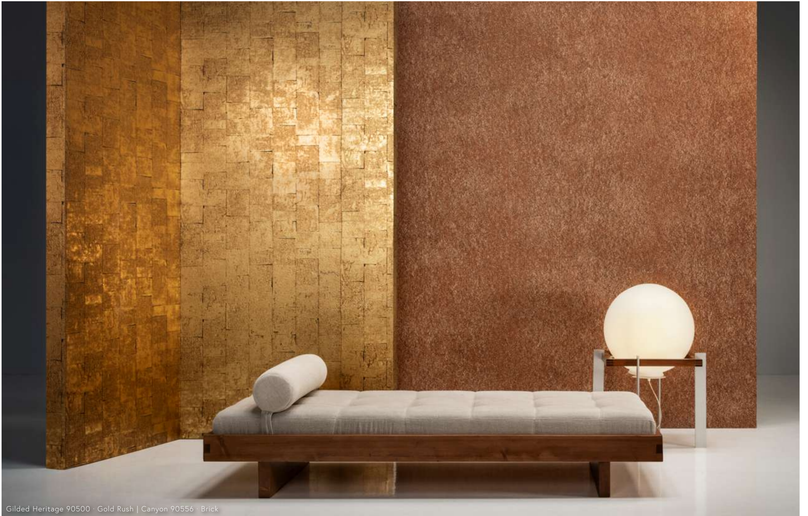
Gilded Heritage 90500 · Gold Rush | Canyon 90556 · Brick