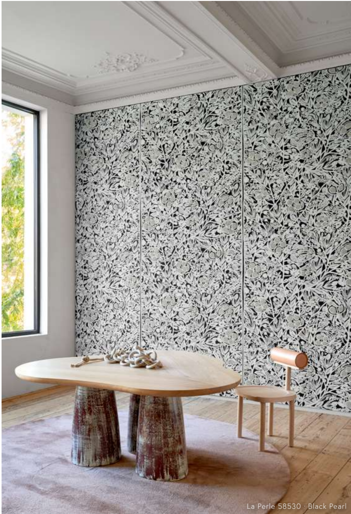
La Perle 58530 · Black Pearl