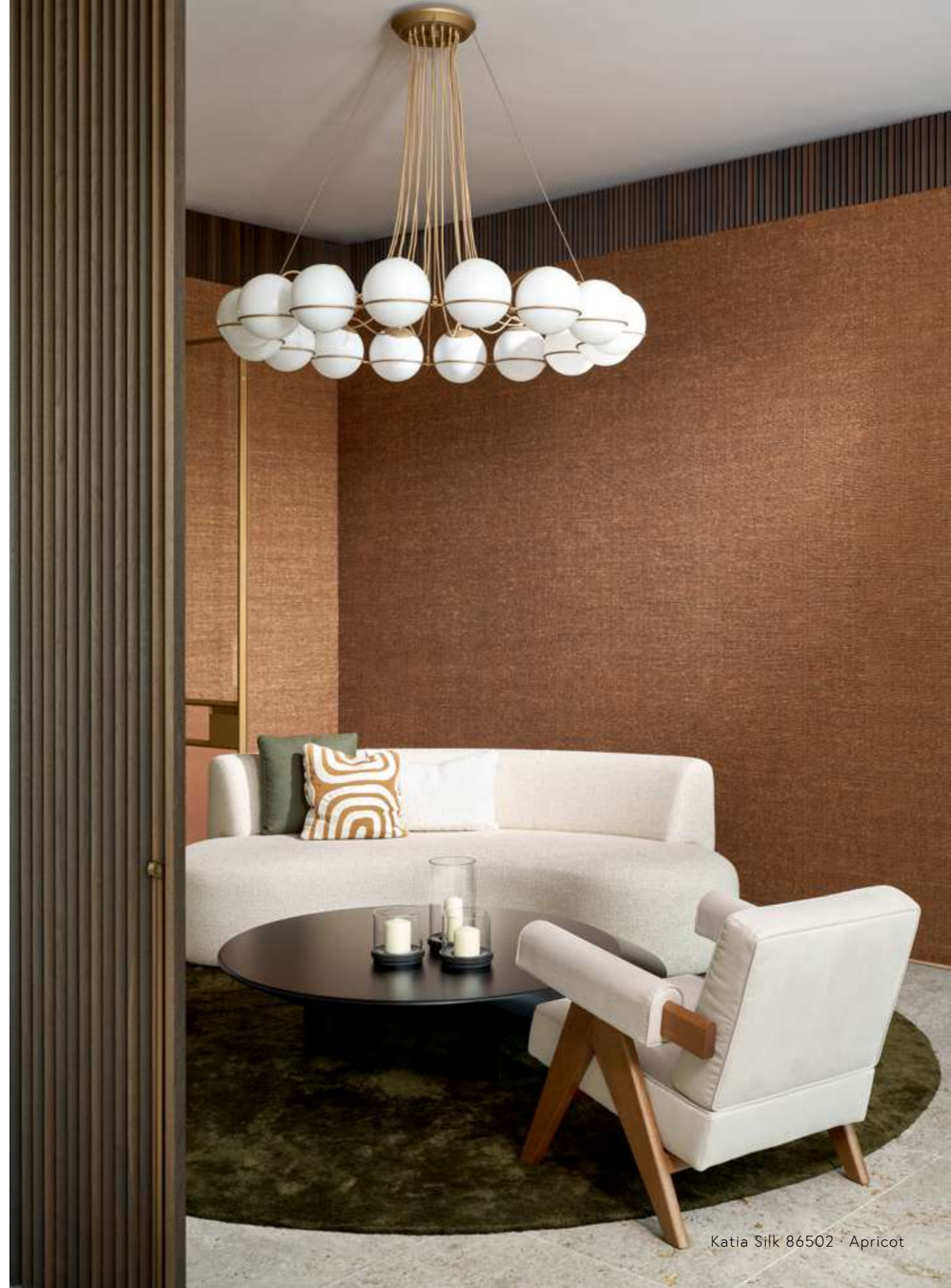
Katia Silk 86502 · Apricot