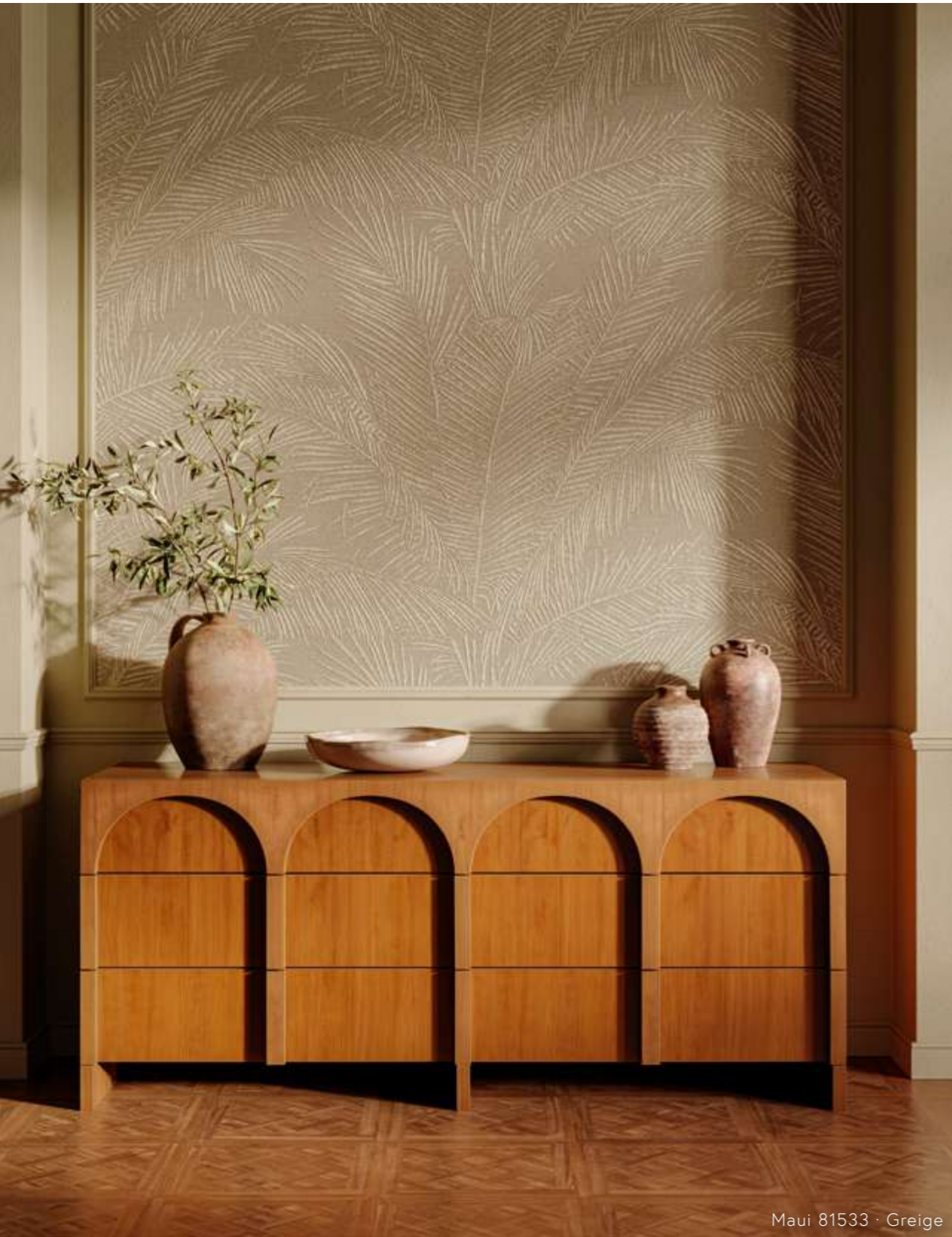
Maui 81533 · Greige