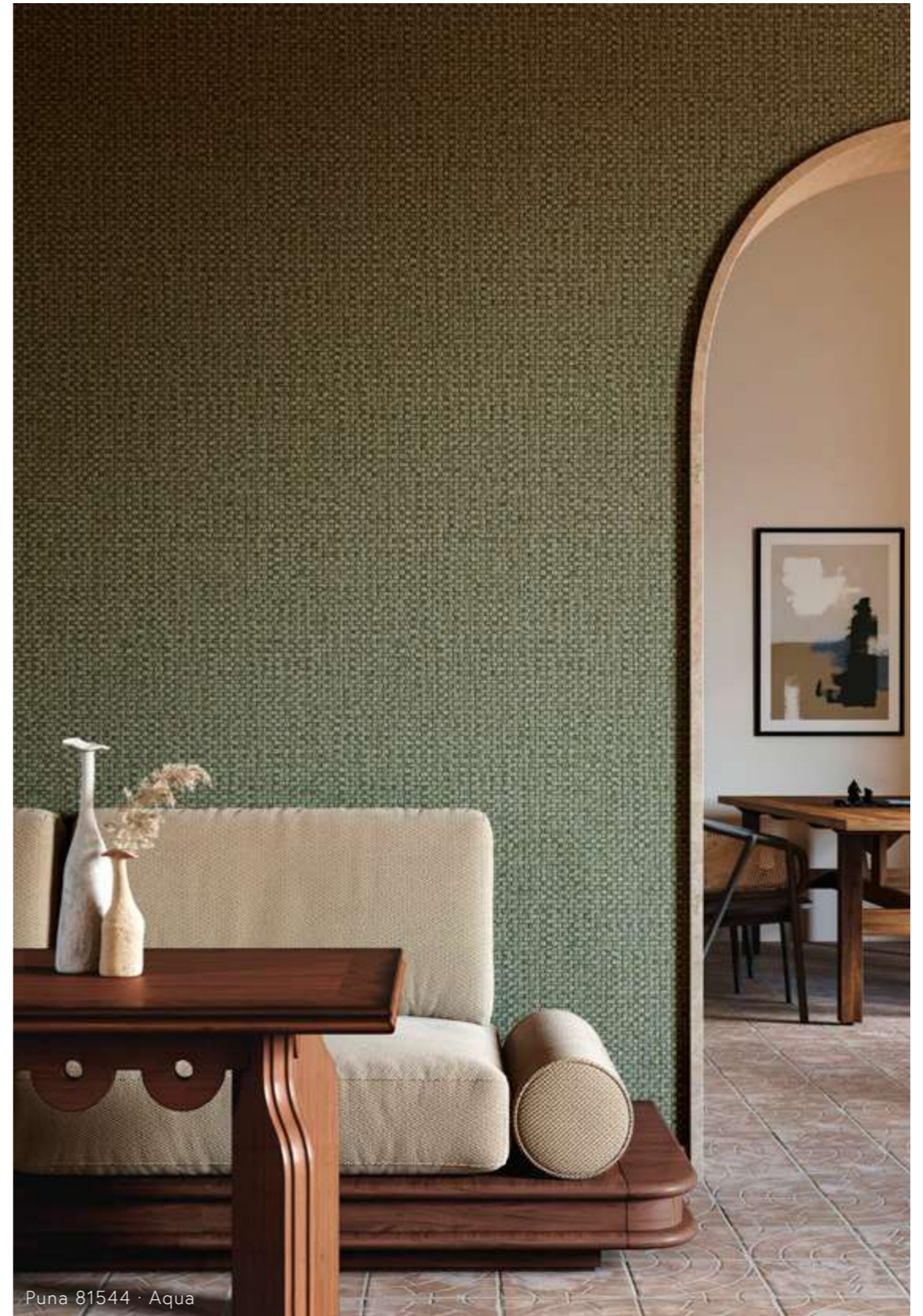
Puna 81544 · Aqua