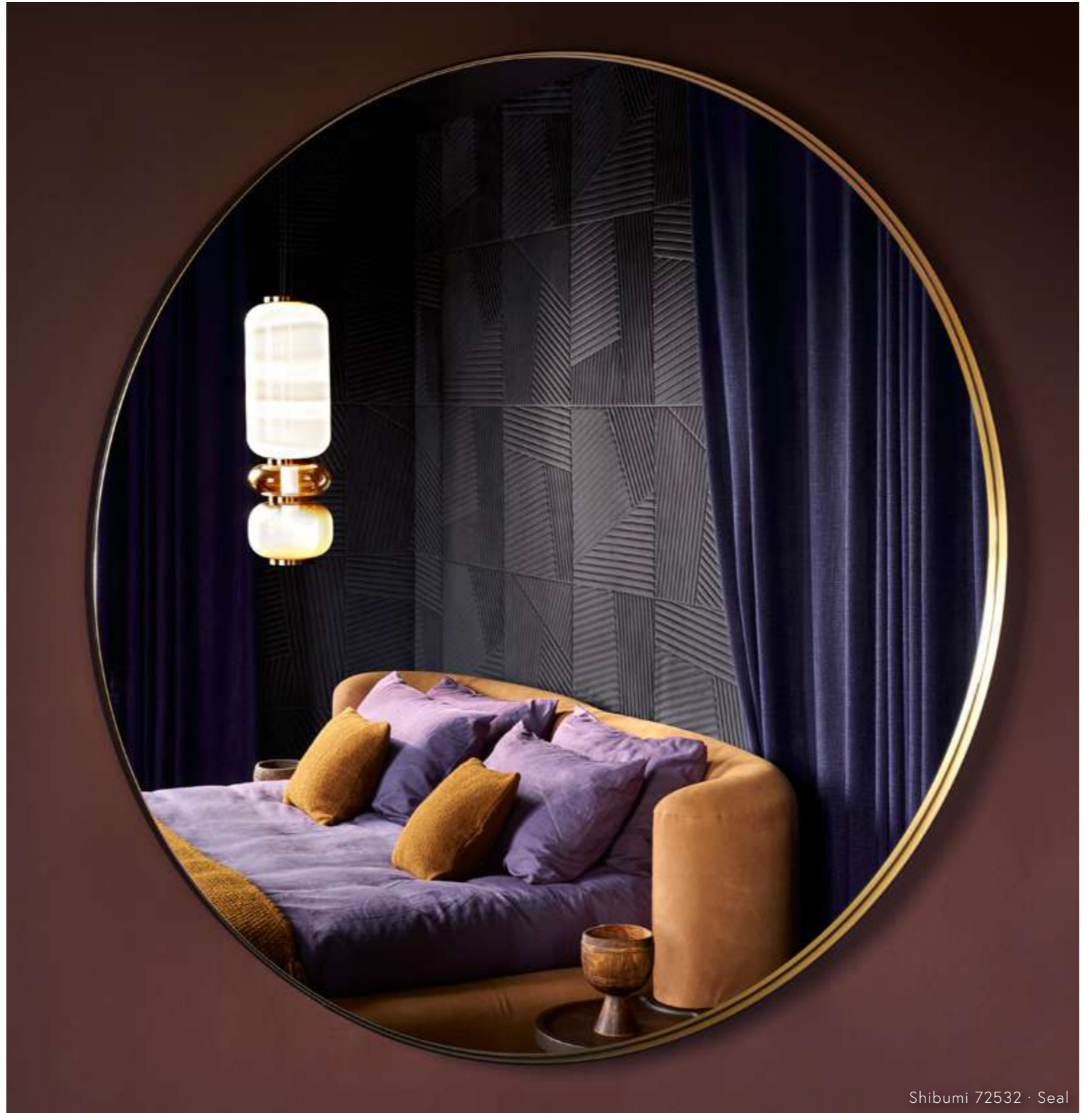
Shibumi 72532 · Seal