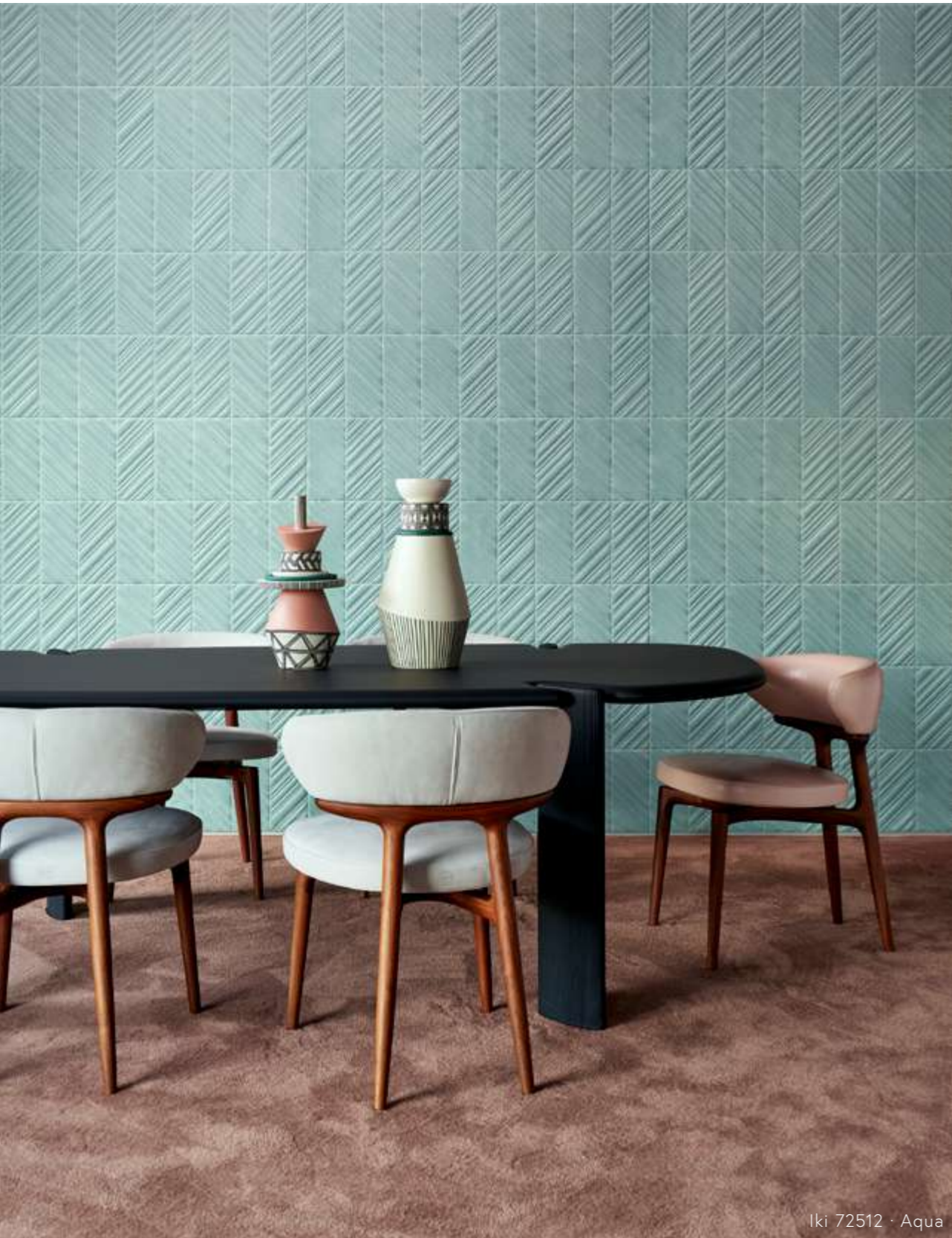
Iki 72512 · Aqua