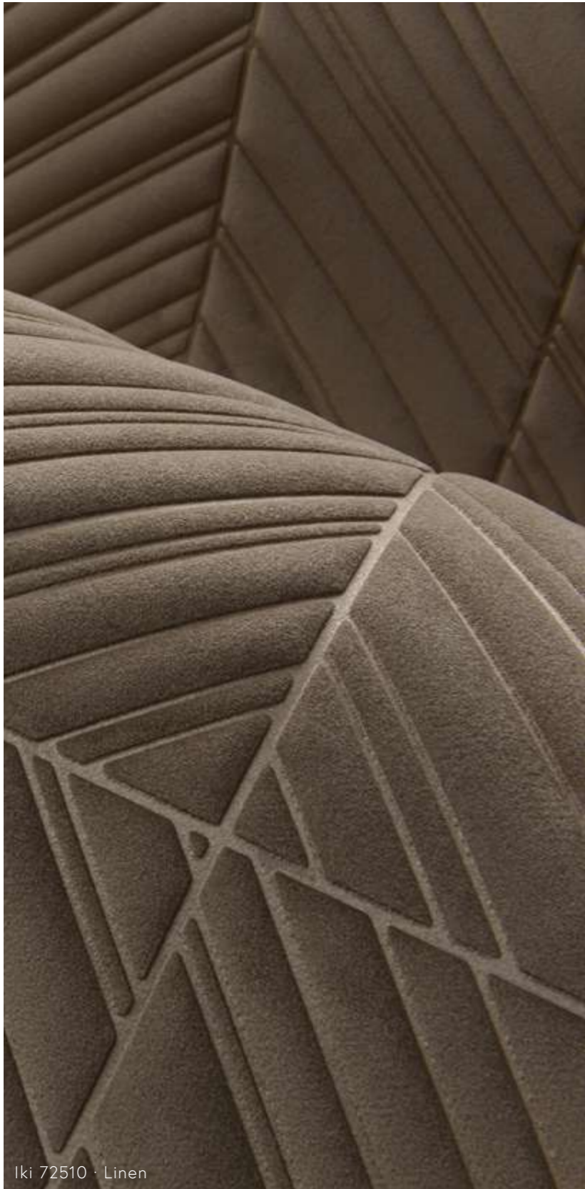
Iki 72510 · Linen