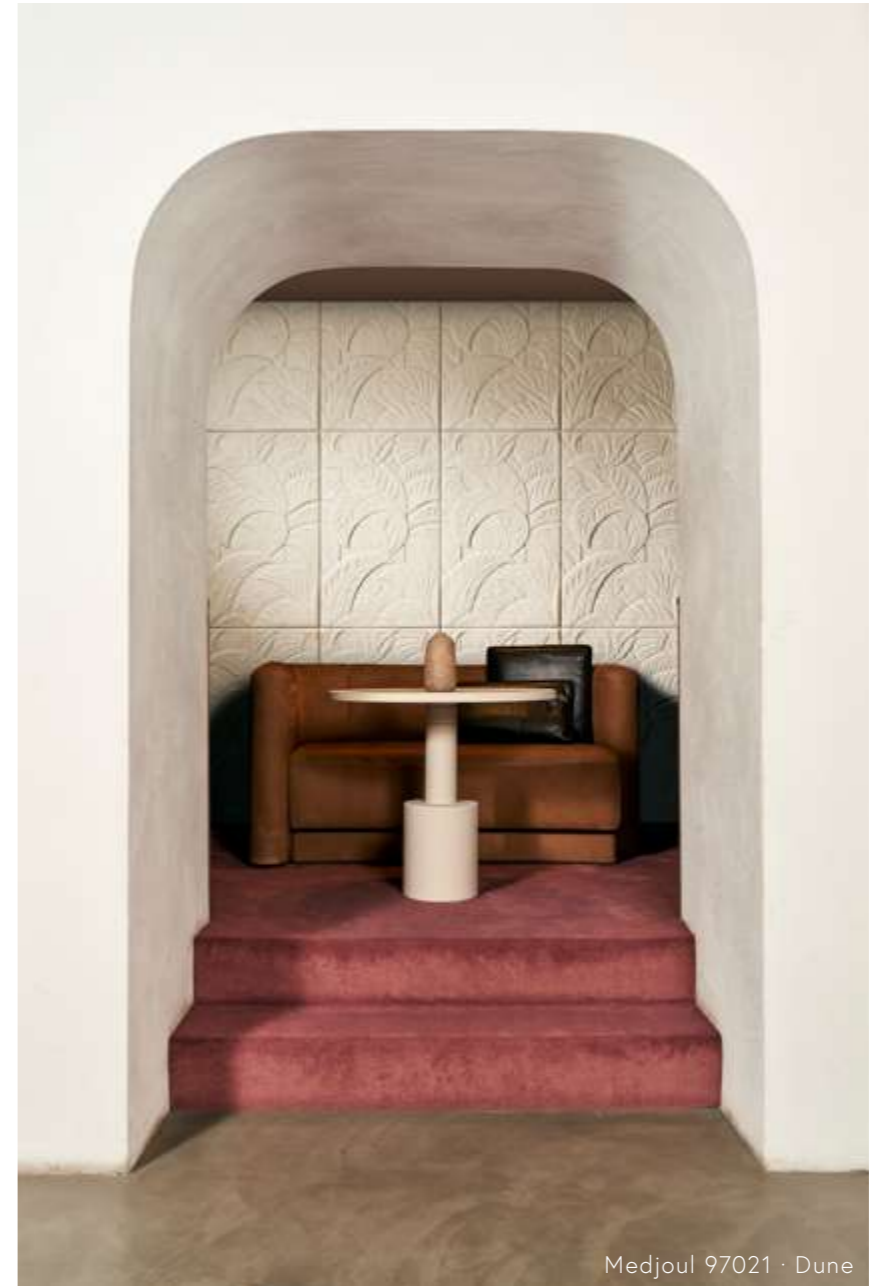
Medjoul 97021 · Dune