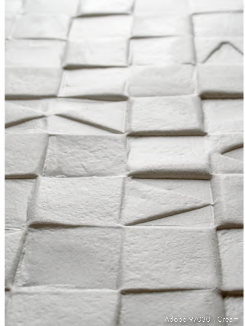
Adobe 97030 · Cream