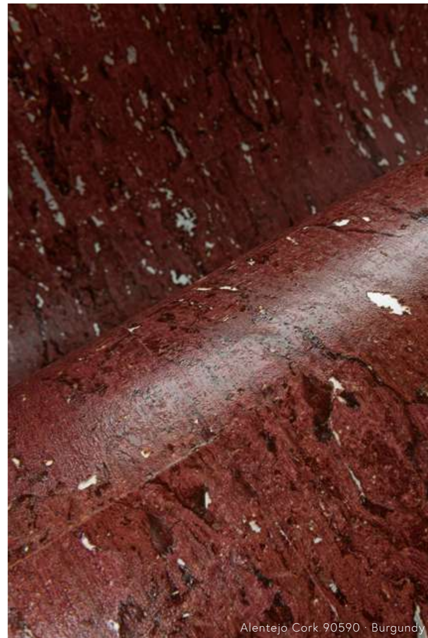
Alentejo Cork 90590 · Burgundy