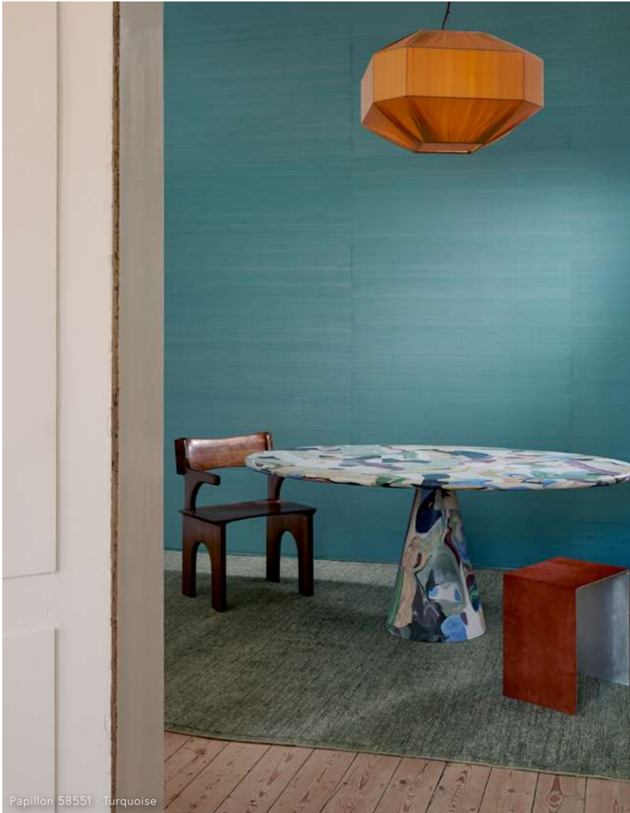
Papillon 58551 · Turquoise