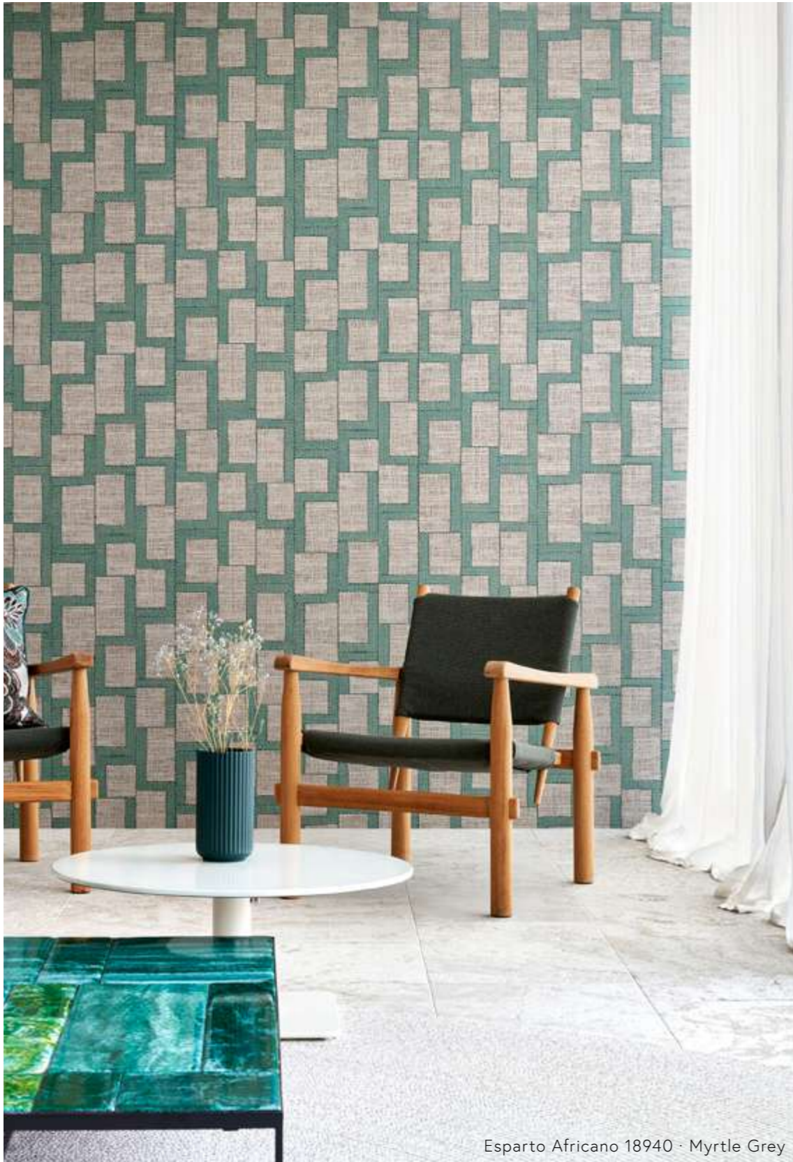
Esparto Africano 18940 - Myrtle Grey