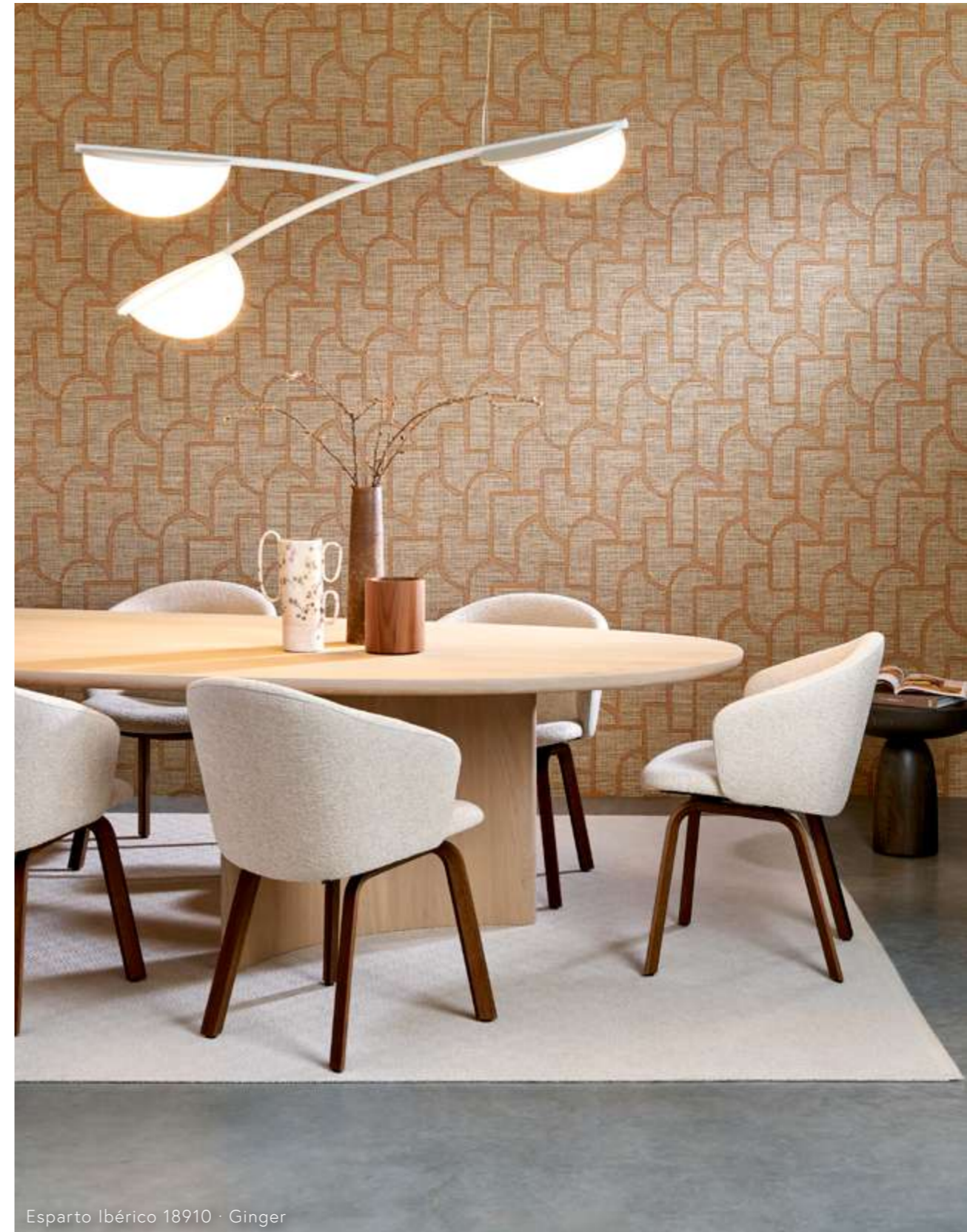
Esparto Ibérico 18910 · Ginger