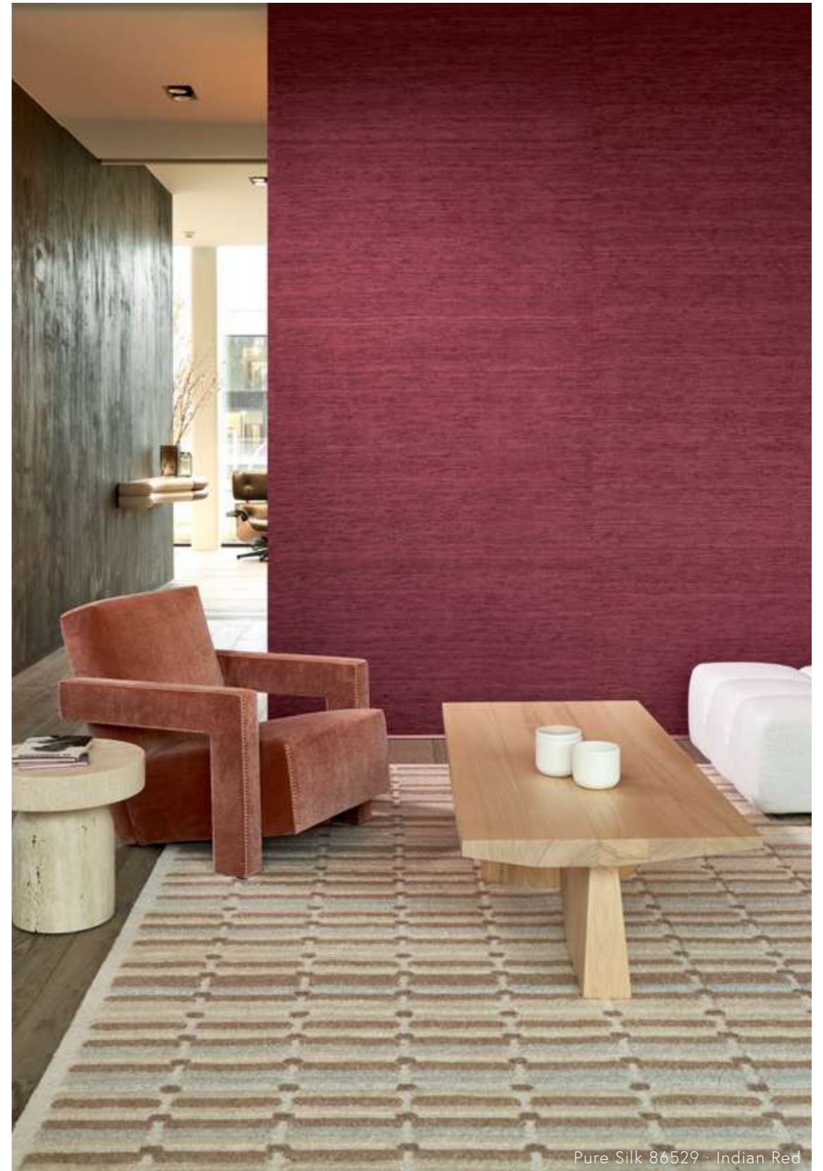
Pure Silk 86529 · Indian Red

The Wild Silk collection is made of real silk, highlighting the versatility of this pure fabric with three distinct types of silk. Each silk in this collection has its own story to tell, with a subtle sheen, robust weave or delicate finesse. Turn your walls into expressive canvases with the luxurious sheen that only real silk can provide. The natural look and feel of this unique, organic fabric adds timeless charm to your interiors. The Wild Silk collection strikes just the right balance between understated elegance and the raw beauty of nature.