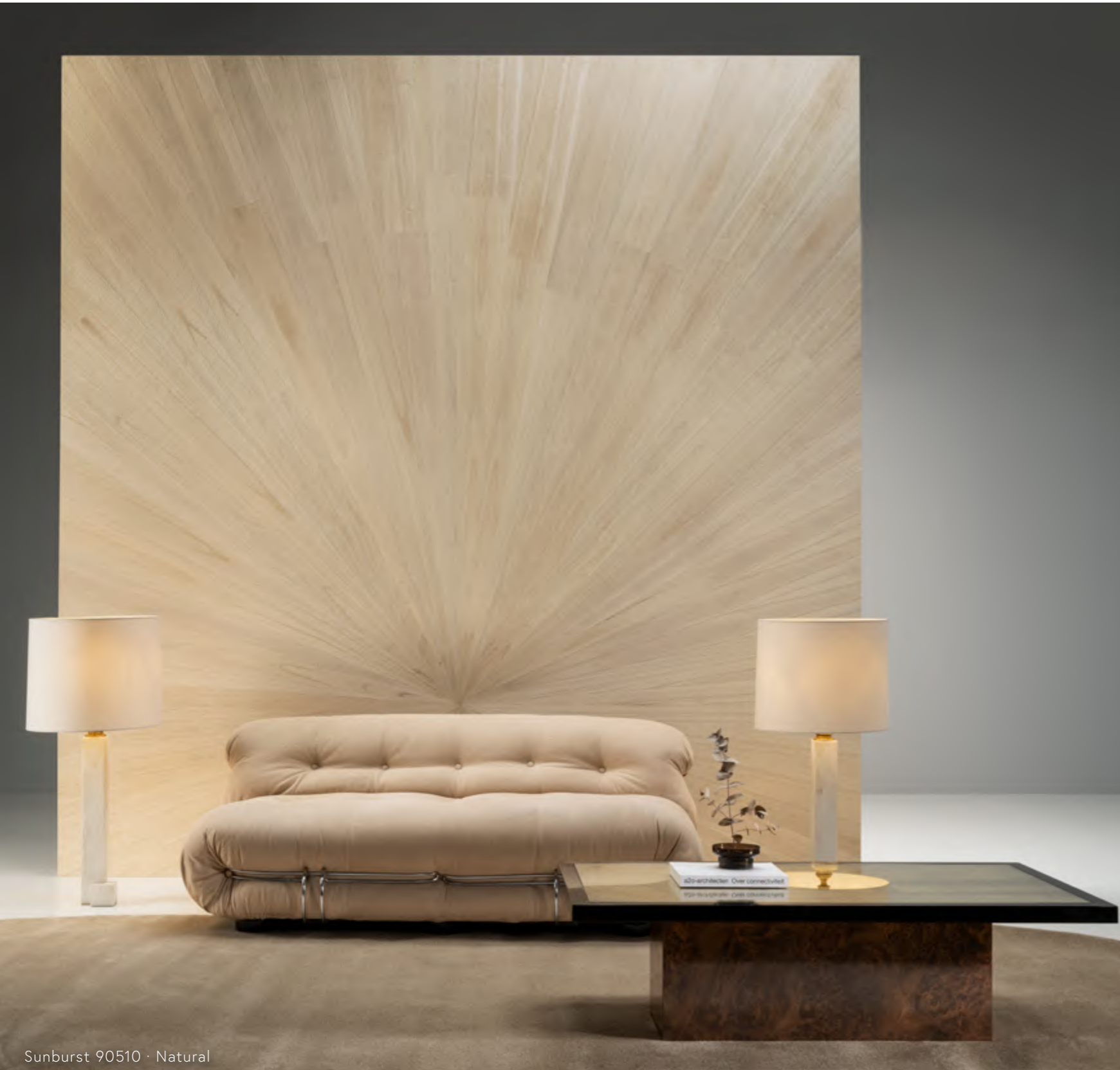
Sunburst 90510 · Natural