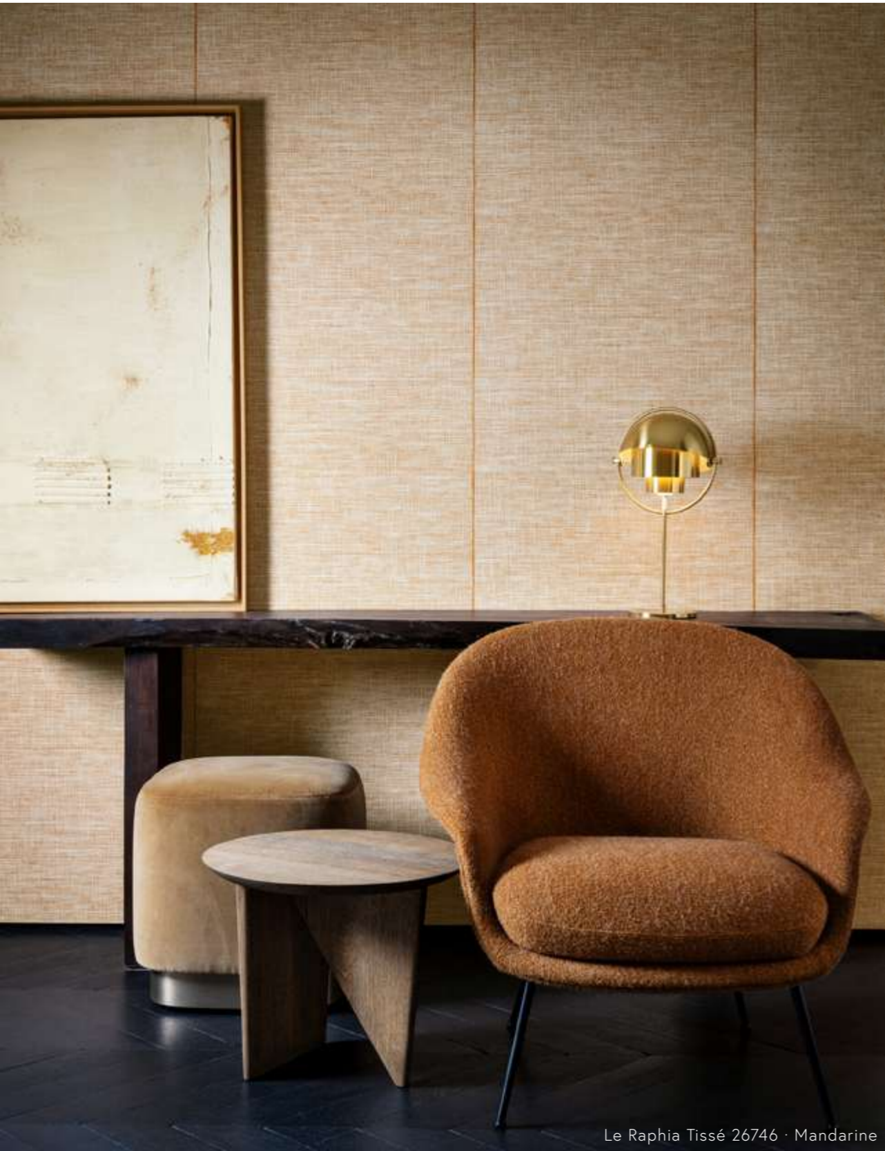
Le Raphia Tissé 26746 · Mandarine