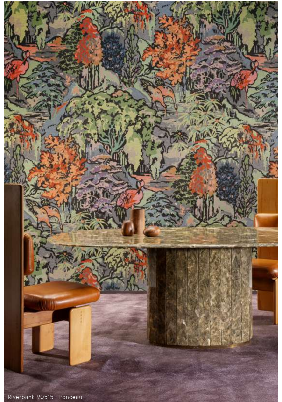
Riverbank 90515 · Ponceau

The wallcoverings in this collection revisit the glamour of mid-century Japan. After World War II, Japan experienced tremendous growth, sparking a transformation marked by vibrant optimism and progressive thinking. In interior design, this hopeful mood manifested itself in new, mostly shiny materials and exuberant patterns, of which there are an abundance in the Boutique wallcoverings.