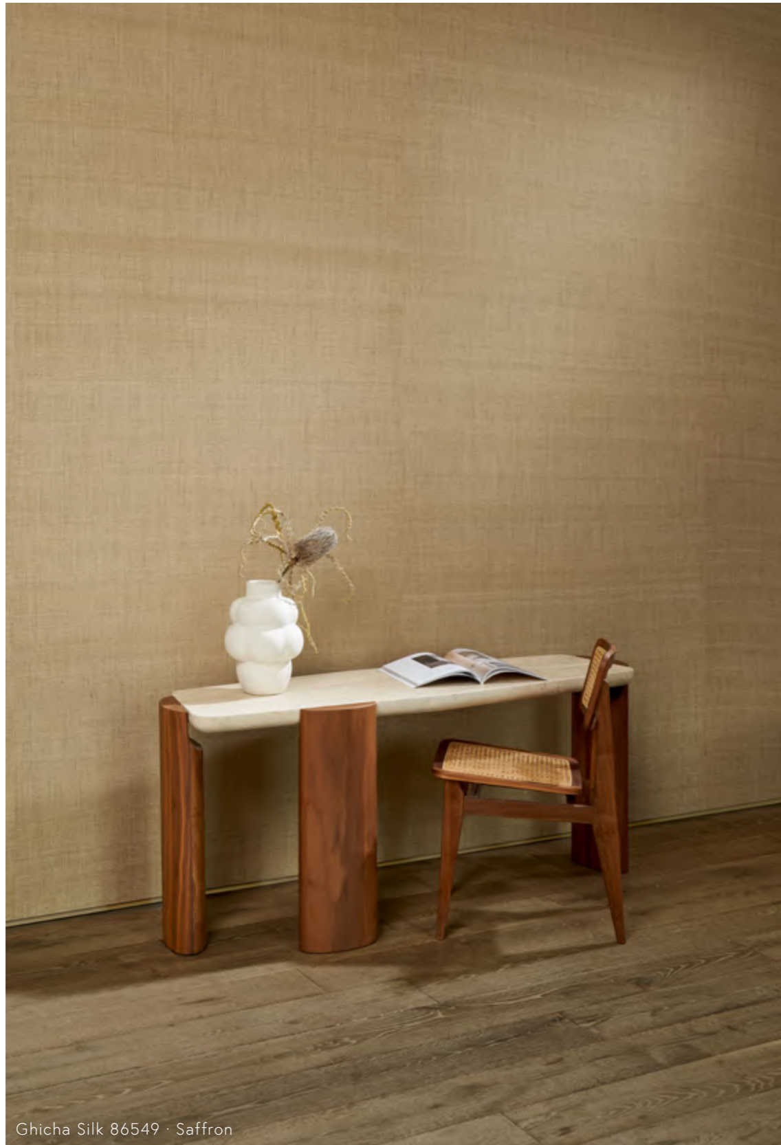
Ghicha Silk 86549 · Saffron