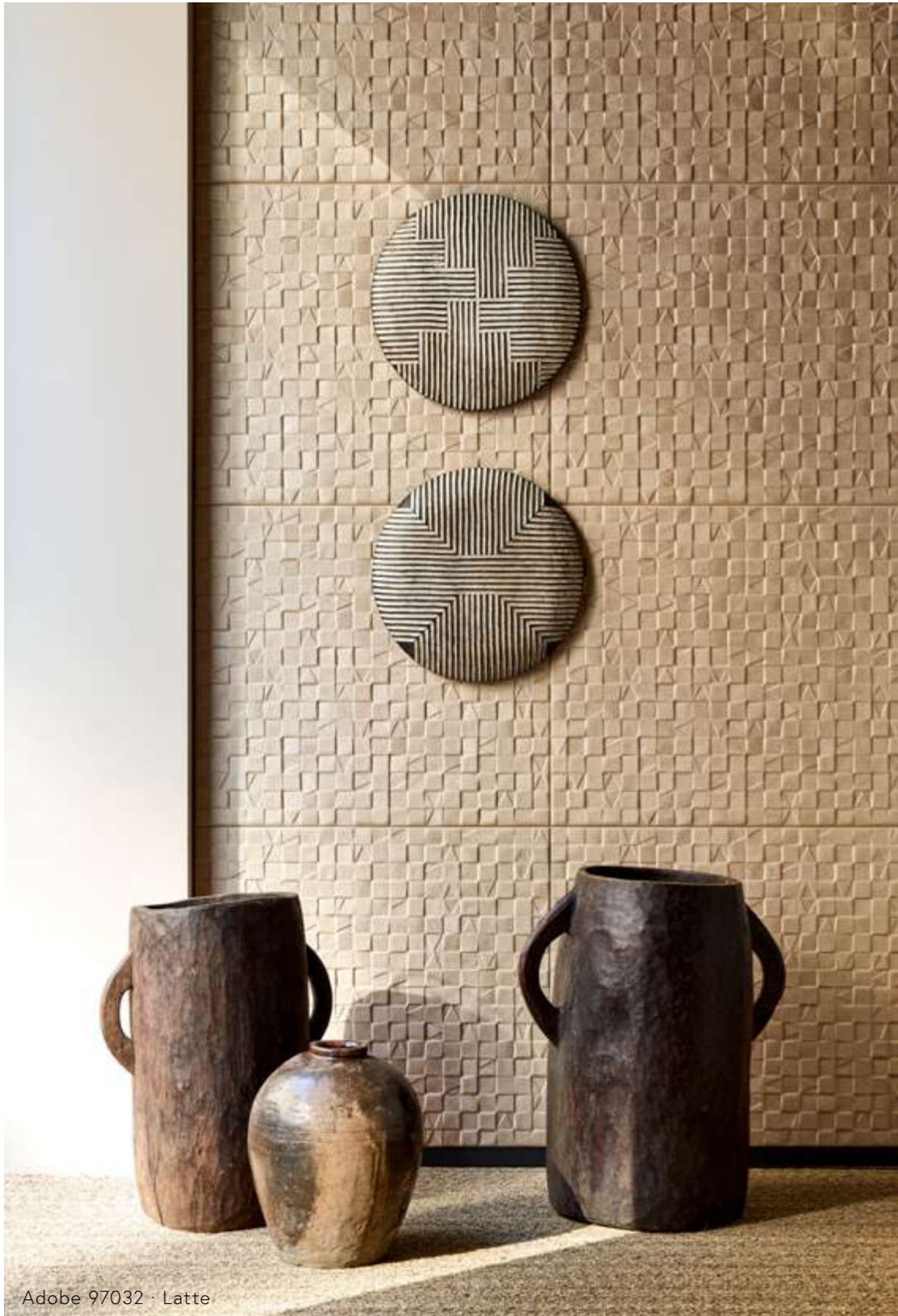
Adobe 97032 · Latte