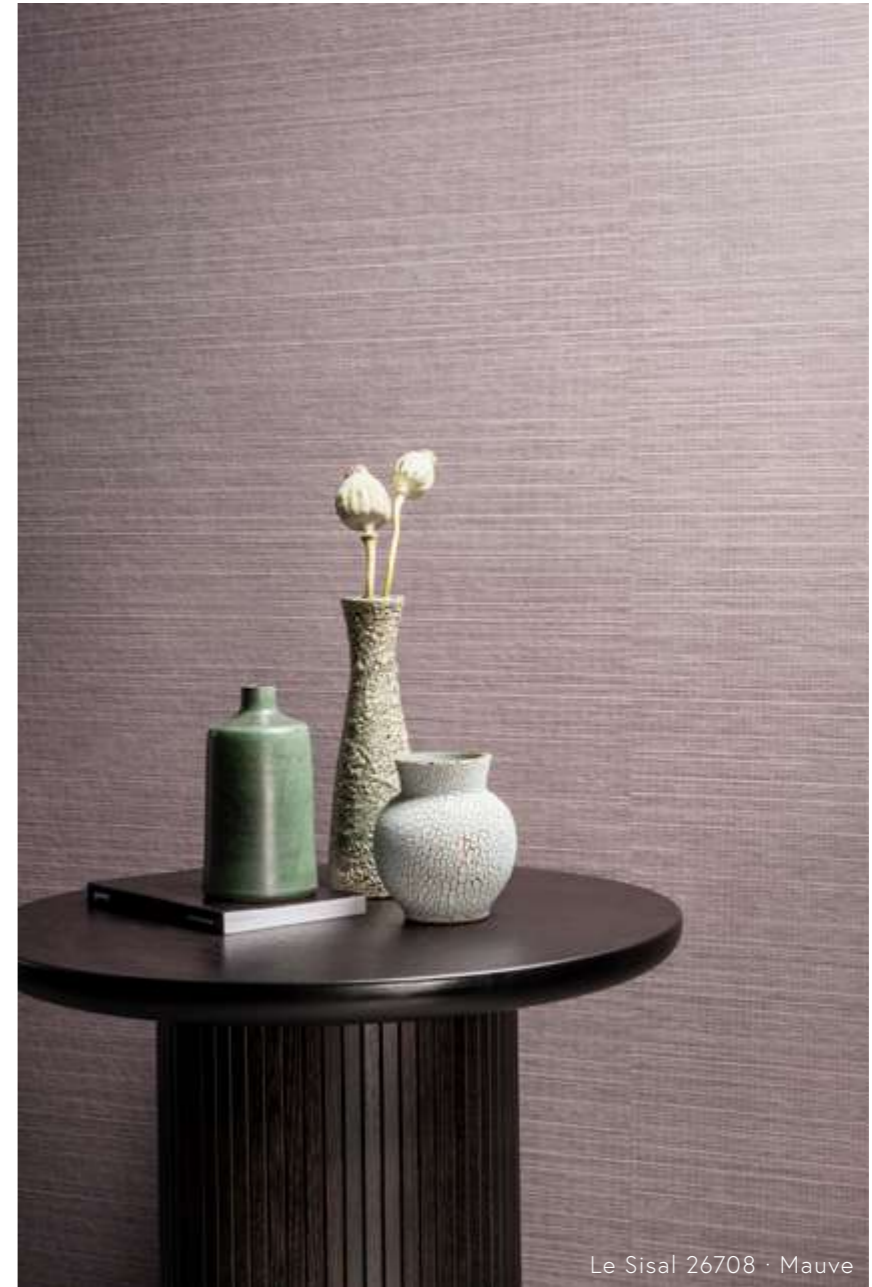
Le Sisal 26708 · Mauve