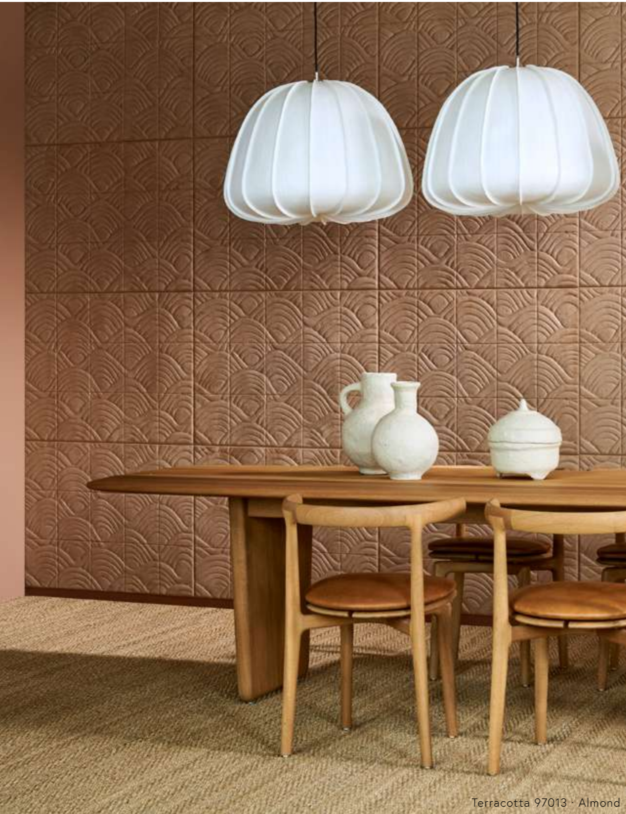
Terracotta 97013 · Almond