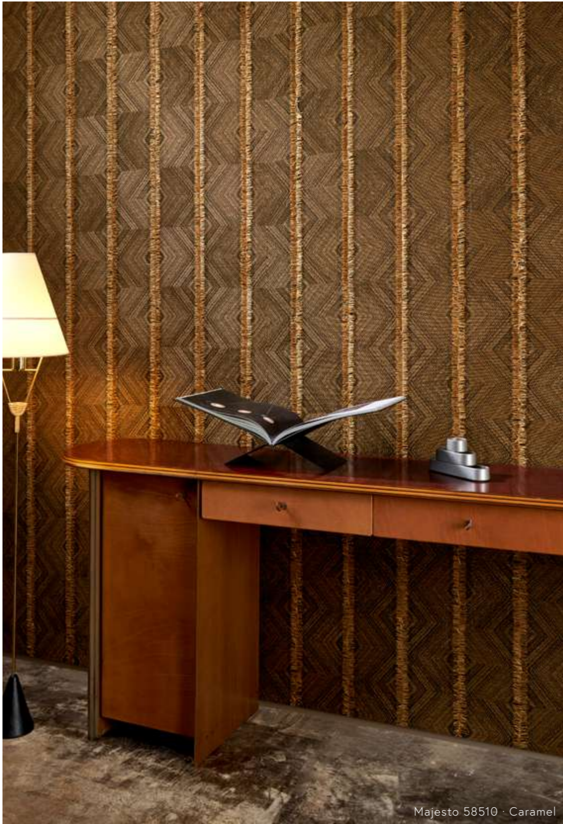
Majesto 58510 · Caramel