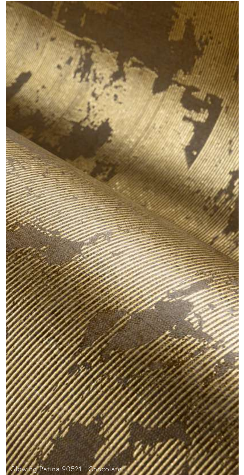
Glowing Patina 90521 · Chocolate