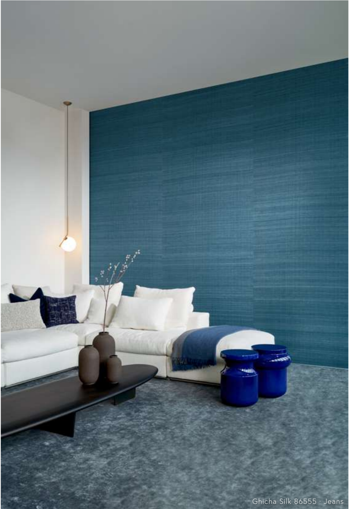
Ghicha Silk 86555 · Jeans