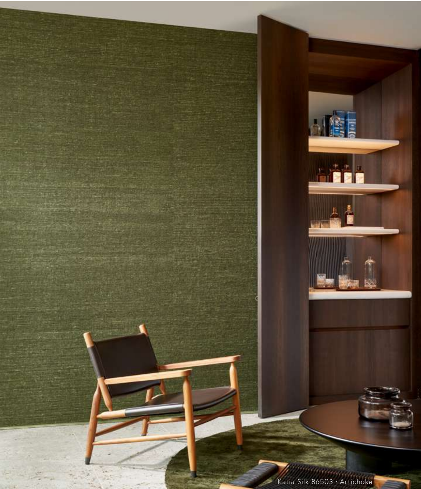
Katia Silk 86503 · Artichoke