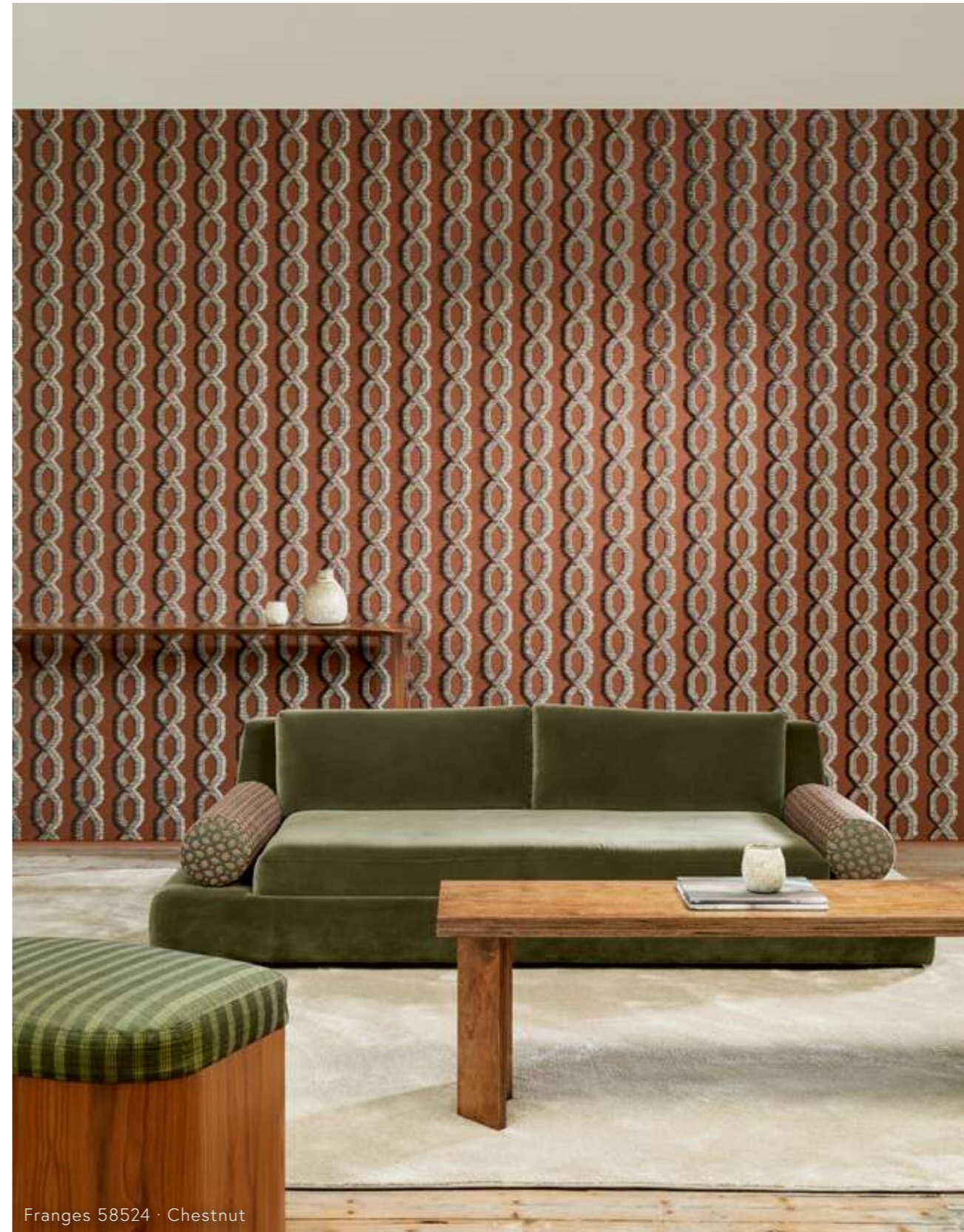
Franges 58524 · Chestnut