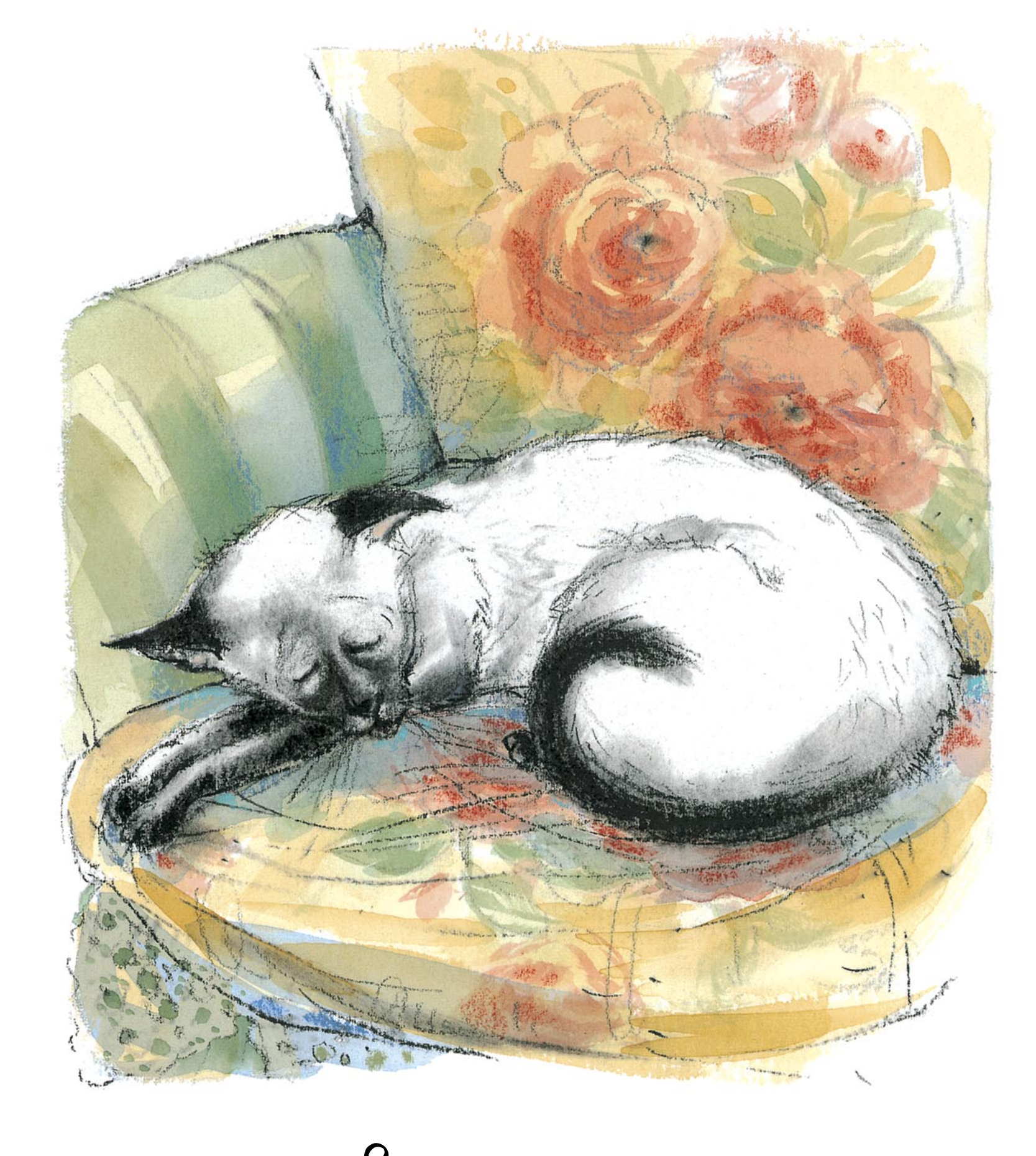
Jimon was a very old cat.