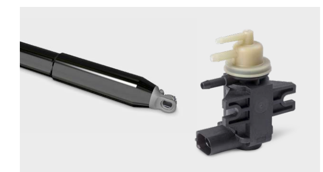
Cylindrical parts, i.e. for automotive applications