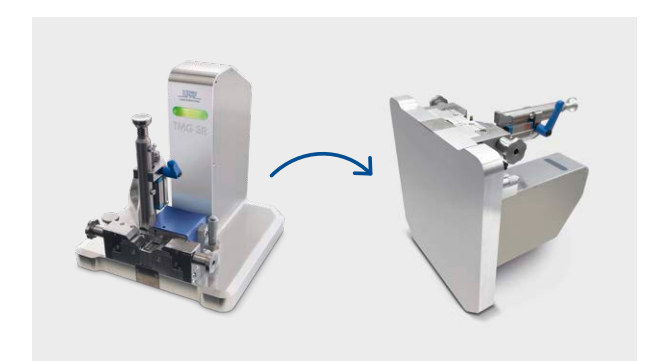
Two operation positions possible for different sizes of parts

LPKF Laser & Electronics AG (Headquarters)