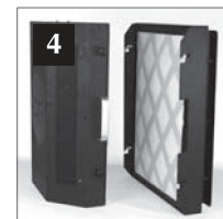
4. Insert the new filter, re-position cover and tighten screws