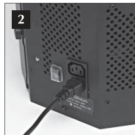
2. Connect the power cord