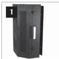
1. Unscrew screws on both sides of the cover

The filters must be changed not washed. Filters need to be changed immediately when the spray solution starts to become visible on the backside of the filter. This is normal at between 80-120 sprays depending on use. Always keep spare filters handy (item number TE301019F).