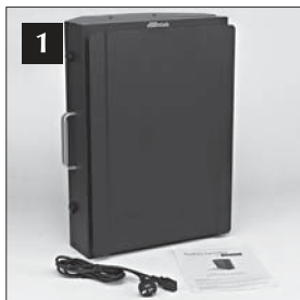
1. Unpack System from packaging