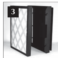
3. Detach and remove the old filter from inside the cover