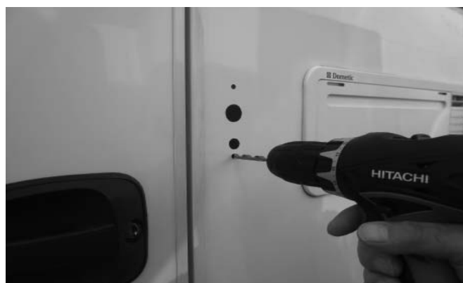
Drill 4 holes