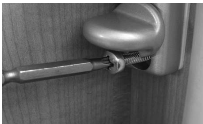
Mount with Screws