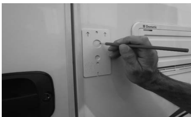
Use Gasket to mark drill position