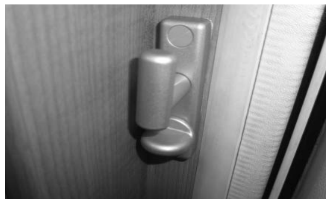
View from inside