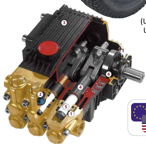
(Used on Aussie Scud, Ultra & Cobra Series)