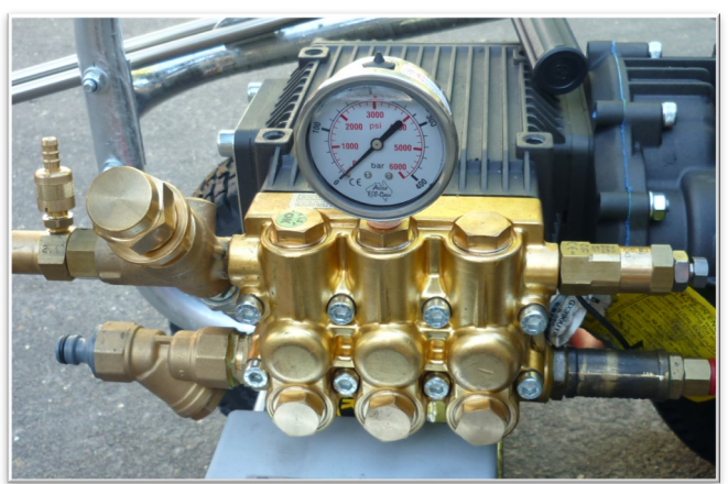
Aussie Safety Protection kit fitted

Aussie Pumps aussiepumps.com.au | 02 8865 3500