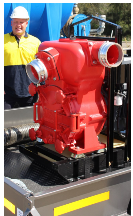
Road registrable trailer option available