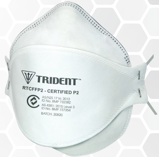
Part No: RTCFFP2