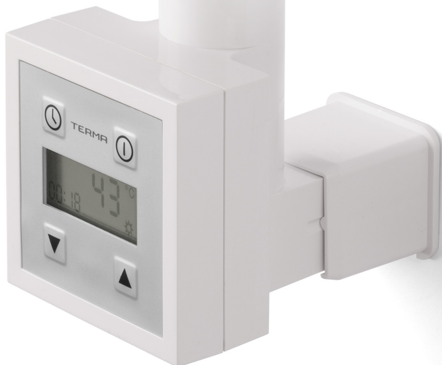
photo: white, connection block under masking cover