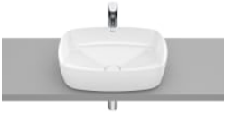
SOFT - Over countertop FINECERAMIC® basin