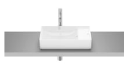
Over countertop vitreous china basin