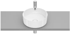
ROUND - Over countertop FINECERAMIC® basin