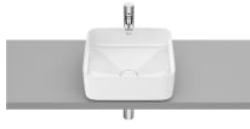
SQUARE - Over countertop FINECERAMIC® basin