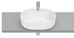
ROUND - Over countertop FINECERAMIC® basin