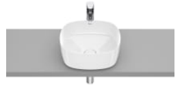
SOFT - Over countertop FINECERAMIC® basin