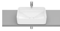
SQUARE - Over countertop FINECERAMIC® basin