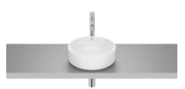
Over countertop vitreous china basin