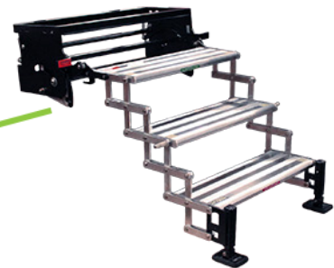
IN WITH THE NEW GlowStep Revolution