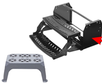
OUT WITH THE OLD Factory Step