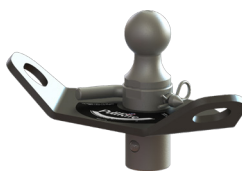
#4437 30K Ball w/ Chain Plate