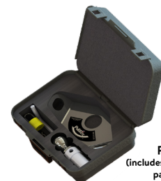
#4438 Premium Ball Kit (includes chrome ball & chain plate, padlock and hardware)