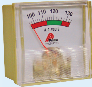
12-4055 Line Voltage Meter