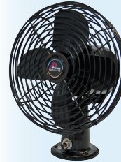
06-0850 Heavy Duty Chrome

Chrome, all metal fan with heavy duty, permanent magnet motor and 6 inch blade. Used in OEM installations including horse trailers. Switch on base allows for convenient high, low, on or off operation. Fan can be permanently mounted on-deck or ceiling. 12 volt applications only.