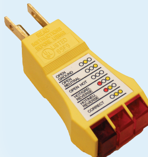
12-4061 AC Circuit Tester