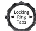
Easy Lock™ Sealing Ring (sold separately) page 27