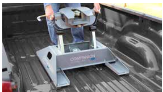
2. Remove Coupler