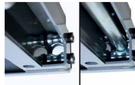
Tight tolerances in the sliding mechanism means smooth movement without the rattle.