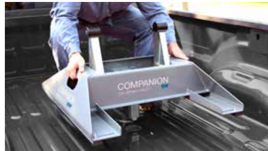
3. Remove Base