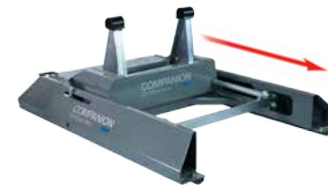
12" of sliding movement for turning and maneuvering clearance in short-bed trucks.