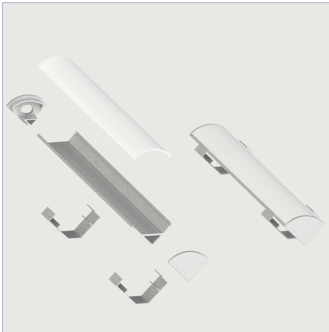
Paris - LL-0725-8