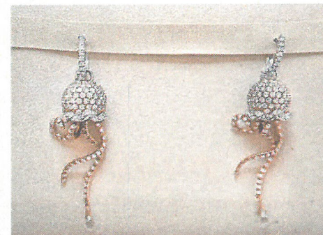
Chantecler diamond jellyfish earrings.