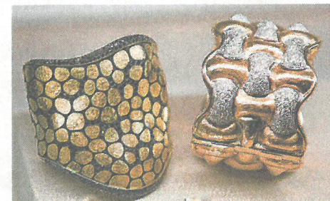
A hammered yellow-gold, black diamond cuff and a hammered rose gold and diamond cuff.