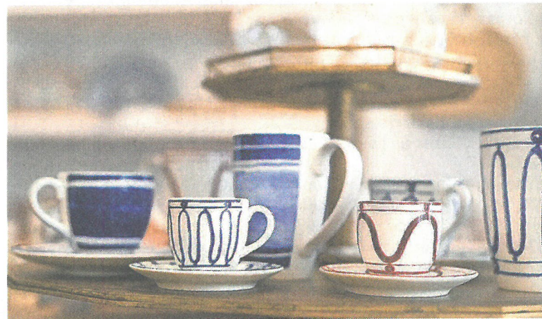
Via Coquina also sells other items, including this Themis Z tableware.