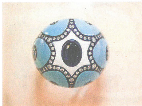
A Chantecler "Maiolica" ring in rose gold, titanium, blue sapphire and turquoise.