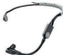
SM35 Headset Microphone