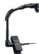
WB98H/C Clip-On Instrument Microphone