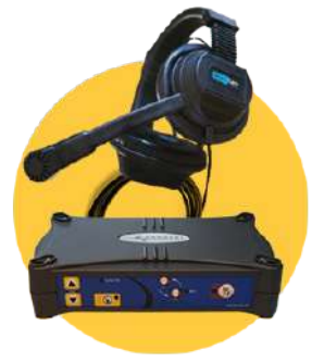
SC2500 Bil-s or Bil-t are installed under the desk, connect to the device sound card and the headsets.