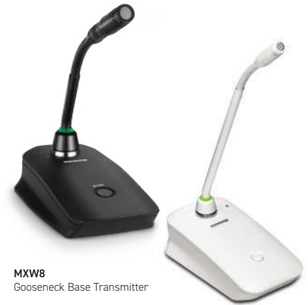
MXW8 Gooseneck Base Transmitter