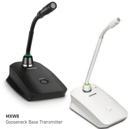
MXW8 Gooseneck Base Transmitter