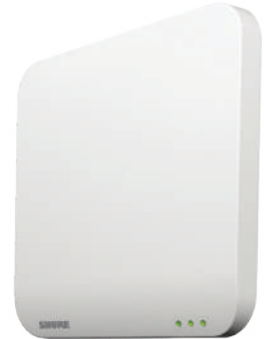
MXWAPT Access Point Transceiver