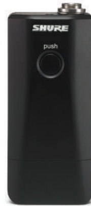
MXW1 Bodypack Transmitter