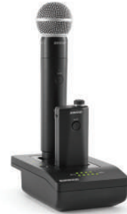
MXWNCS2 Networked Charging Station shown with MXW2/SM58 and MXW6