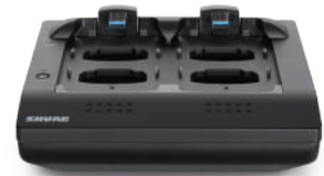
MXWNCS4 Networked Charging Station