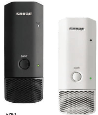
MXW6 Boundary Transmitter