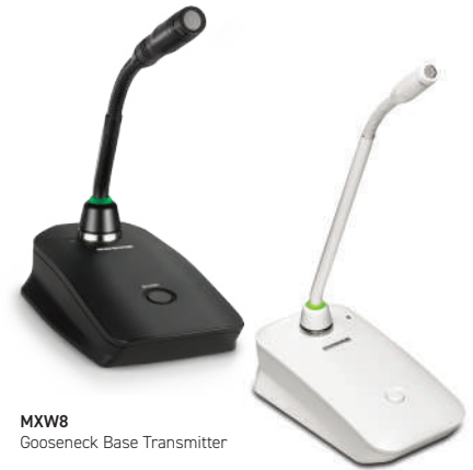
MXW8 Gooseneck Base Transmitter