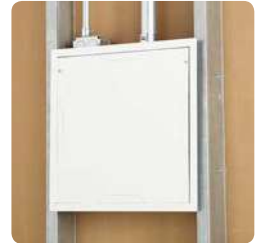
Paintable Flanges and Covers