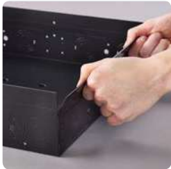
Break Away Edges

Chief engineers talked to customers like you about in-wall boxes and your biggest headaches on the construction site. Then they designed all new in-wall boxes to solve those headaches with multiple depth and ordering options.