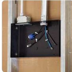
Zip tie Anchor Points