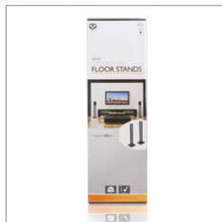
Supplied in retail packaging - ideal for the consumer market