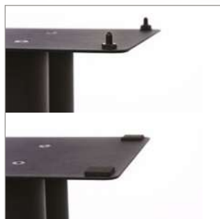
Supplied with isolation spikes and alternative foam pads