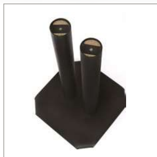
Use dry sand to fill columns for superior dampening