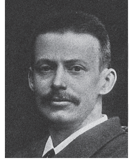
Dr. Niels Ryberg Finsen 1903 Nobel Prize Winner in Physiology and Medicine

Niels Ryberg Finsen (15 December 1860 - 24 September 1904) was a Danish-Faroese physician and scientist. He is the first Nobel laureate from the country and the founder of modern phototherapy. Dr Finsen, received the 1903 Nobel Prize in Physiology for the application of light in medicine. Diagnosed with Niemann-Pick disease, his condition served as a catalyst to further explore the scientific benefits of light. By 1893, Dr Finsen's research of light lead to the foundation of modern phototherapy. His laboratory work and subsequent clinical experiments successfully showed that rays of light such as red light and Ultraviolet (UV) rays were effective in treating smallpox and lupus vulgaris respectively.