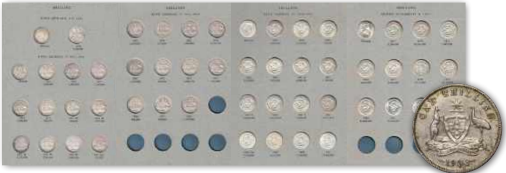
SHILLING SET, INCLUDING 1933, GOOD-UNC $375.00