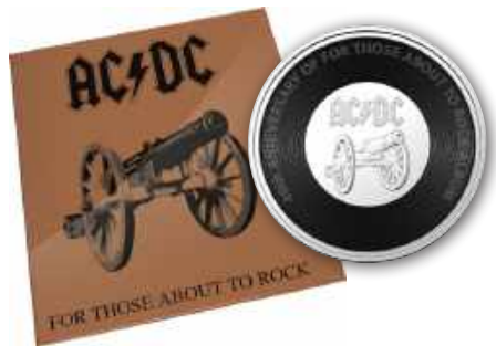
2021 - FOR THOSE ABOUT TO ROCK

2020/2021 COLOURED 20 CENT, CARDED, UNC $15.00 EACH