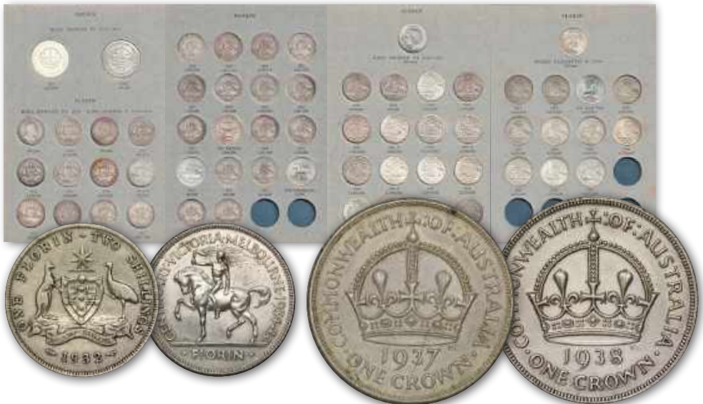
FLORIN & CROWN SET, GOOD-UNC $1550.00