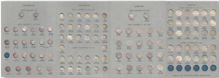
THREEPENCE & SIXPENCE SET, NO OVERDATES, GOOD-UNC $275.00