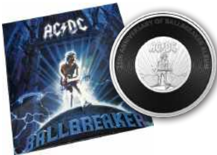
2020 - BALLBREAKER