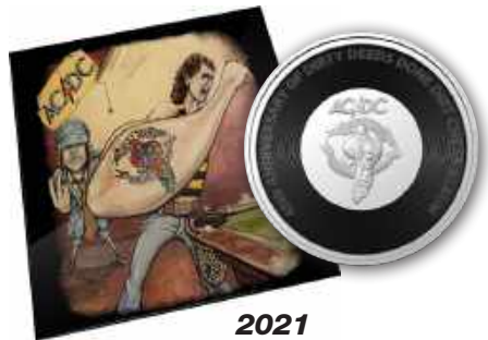
2021 DIRTY DEEDS DONE DIRT CHEAP