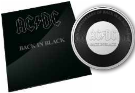
2020 - BACK IN BLACK

Australian Rock Royalty AC/DC have kept the world thunderstruck for close to five decades. To celebrate the milestone anniversaries of six of their album releases, the Royal Australian Mint has struck coin tributes to the vinyls that have electrified generations of music lovers.