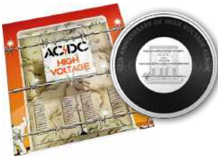
2020 - HIGH VOLTAGE