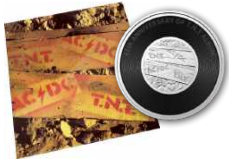
2020 - T.N.T