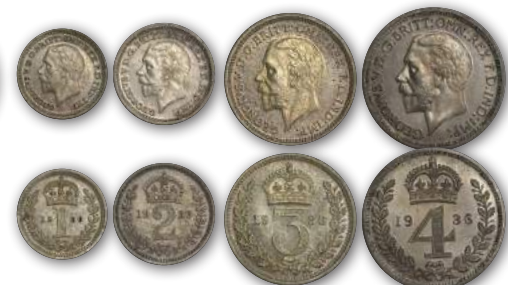
1936 George V, S.4043 FDC $600.00 THE YEAR OF 3 KINGS, LAST OF GEORGE V, DISTRIBUTED BY EDWARD VIII