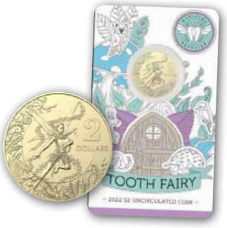
$2 2021 TOOTH FAIRY CARDED, $2 2022 TOOTH FAIRY CARDED, UNC $15.00