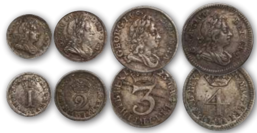
1723 George I, S.3658 EF $1000.00