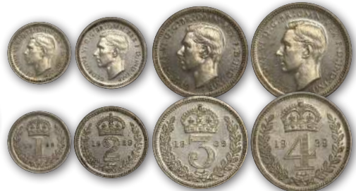
1939 George VI, S.4086, light tone, Lustrous FDC $350.00