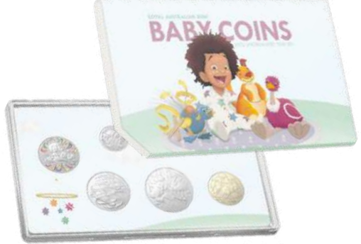
2022 6 COIN BABY MINT SET $45.00