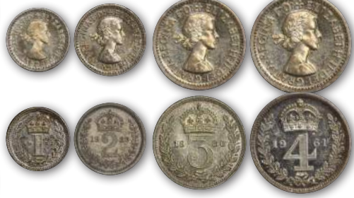
1961 Elizabeth II, in plastic case, S.4131, toned FDC $400.00

ONLY 1 OF EACH AVAILABLE, RESERVATIONS HIGHLY RECOMMENDED