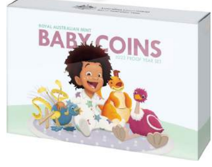
2022 6 COIN BABY PROOF SET $130.00