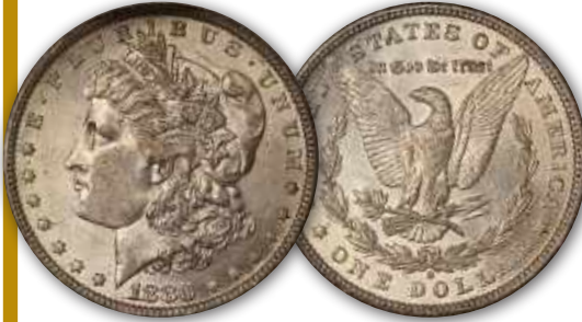
1880 O Light tone, Lustrous UNC $250.00

CC = CARSON CITY MINT, O = ORLANDO MINT, P = PHILADELPHIA MINT, S = SAN FRANCISCO MINT