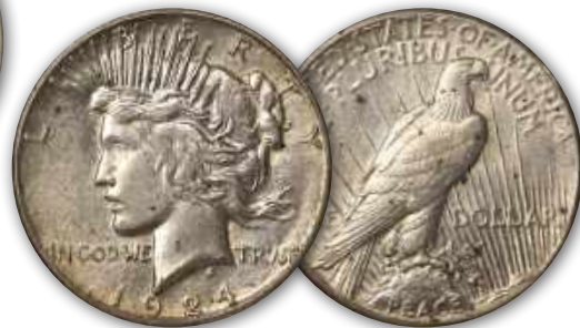
1924 P Light tone, Lustrous UNC $50.00