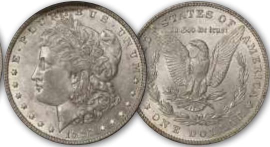
1885 P Light tone, Lustrous UNC $75.00 , Light tone, Lustrous Brilliant UNC $150.00