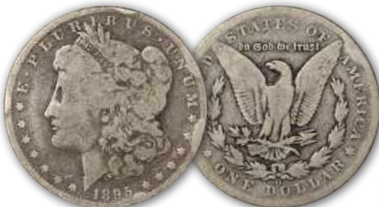
1895 O Several knocks, VG $200.00