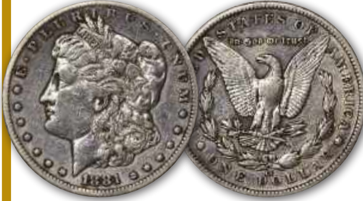
1881 CC Washed, VF $500.00