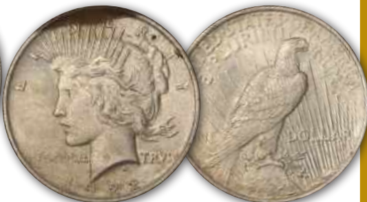
1922 P Light tone, Lustrous UNC $50.00