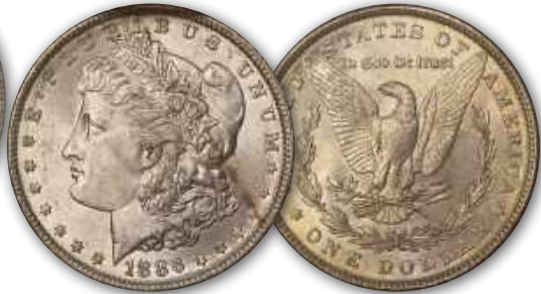
1886 P Light tone, Lustrous UNC $100.00 , Light tone, Lustrous Brilliant UNC $150.00