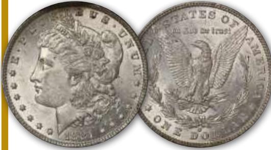
1881 O Edge heavily toned, light tone, Lustrous Brilliant UNC $150.00