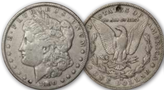
1890 CC Reverse damaged, FINE $95.00