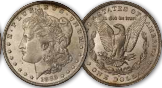
1885 O Light tone, Lustrous Brilliant UNC $150.00