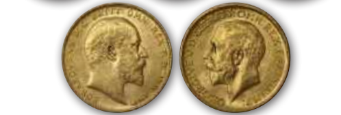
Sovereign Type Set Queen Victoria Young, Jubilee & Veiled Heads, Edward VII and George V VF-UNC $3750.00