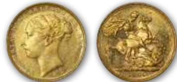
1880 Sydney, Lustrous UNC $3000.00