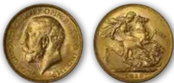
1915 Perth Lustrous UNC $1400.00