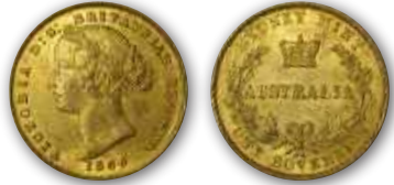
1866 Sydney Mint, Lustrous UNC $2500.00