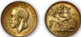
1915 Perth, light tone, Lust. UNC $850.00