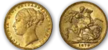
1879 Sydney, St George EF $1500.00