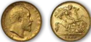
1909 Melbourne, Lustrous nUNC $1000.00