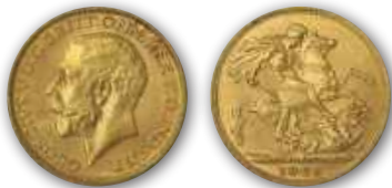
1926 Perth Lustrous UNC $3000.00 VERY RARE IN HIGH GRADES!