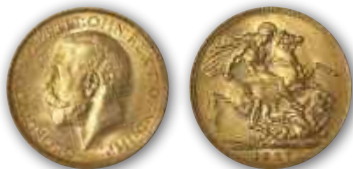
1927 Perth Lustrous UNC $1250.00