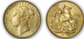
1872 Melbourne, St George reverse, Lustrous nUNC $3750.00