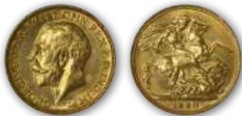
1928 Melbourne Lustrous UNC $4500.00