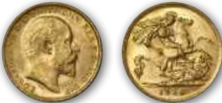
1910 Sydney Lustrous UNC $950.00