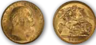
1908 Sydney, Lustrous Brilliant UNC $1750.00