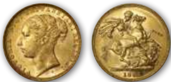
1885 Sydney, St George, Lustrous UNC $3000.00