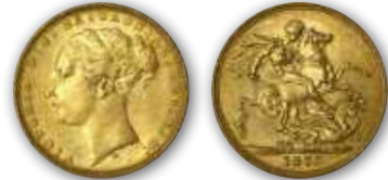
1873 Melbourne, St George reverse, Lustrous UNC $2750.00