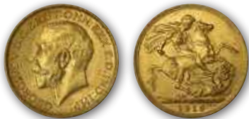
1919 Melbourne Lustrous UNC $1750.00