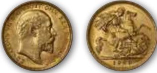
1908 Melbourne, Lustrous UNC $1750.00