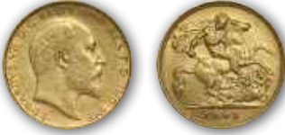
1908 Perth VF $1000.00, EF $3000.00 VERY LOW MINTAGE, RARE IN HIGH GRADE