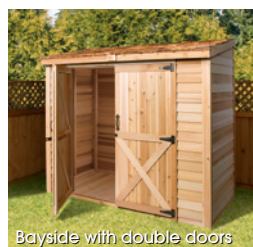
Bayside with double doors