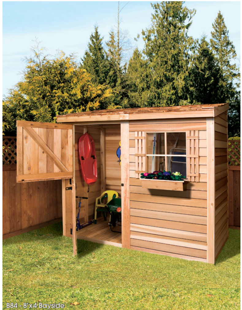
B84 - 8'x4' Bayside