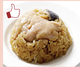
糯米鸡 Glutinous Rice w/ Chicken