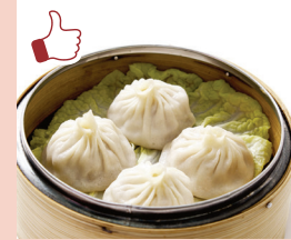
上海小笼包 Shanghai Xiao Long Bao