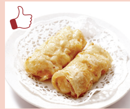
鲜虾腐皮卷 Beancurd Prawn Roll