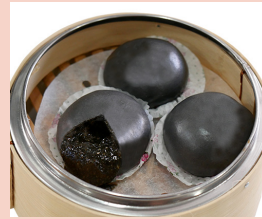
黑芝麻流沙包 Black Sesame Lava Bao