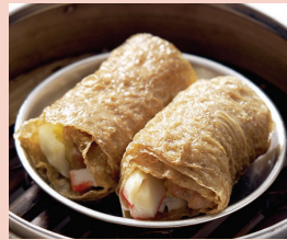
鱼肉蟹柳卷 Beancurd Seafood Roll