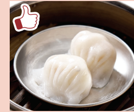
虾饺 Har Gao