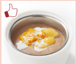
南瓜白果芋泥 Yam Paste w/ Gingko Nut