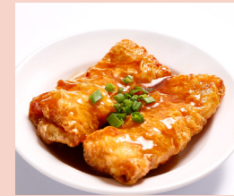
蚝油鲜竹卷 Beancurd Roll in Oyster Sauce