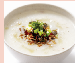
皮蛋粥 Congee w/ Minced Pork & Century Egg