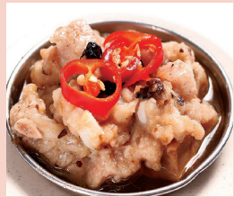
豉汁排骨 Steamed Pork Ribs