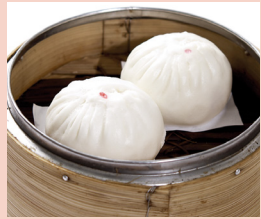
叉烧包 Char Siew Bao