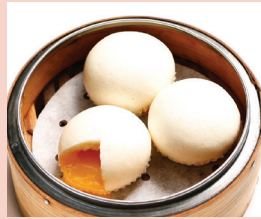
奶黄流沙包 Salted Egg Yolk Custard Bun