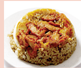
饭菜 BBQ Pork Rice