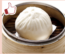
瑞春招牌大包 Swee Choon Big Bao