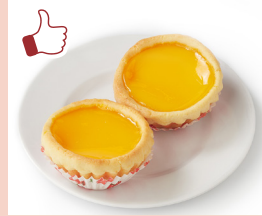
港式蛋挞 Baked Hong Kong Egg Tart