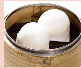
莲蓉包 Lotus Paste Bao