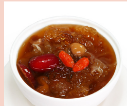
桃胶炖雪耳 Peach Gum & Snow Fungus