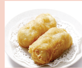
香蕉炸虾筒 Prawn & Banana Fritter