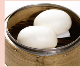
豆沙包 Red Bean Paste Bao