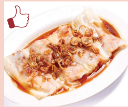
叉烧肠粉 Rice Roll with Char Siew