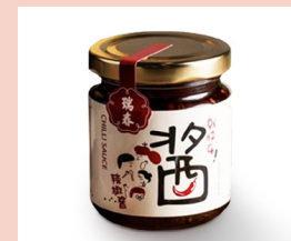
虾米辣椒 Hae Bi Hiam Chilli