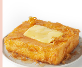
蜜糖黄油港式西多士 HK Style Honey Butter French Toast