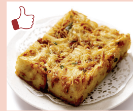
瑞春面线糕 Mee Suah Kueh