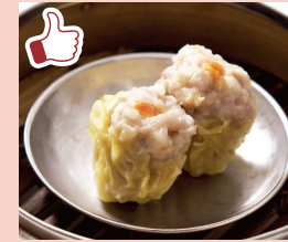
烧卖 Siew Mai