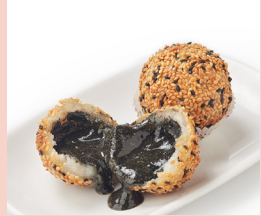
黑芝麻流沙球 Black Sesame Lava Ball