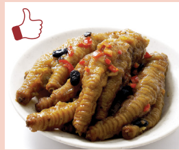
凤爪 Chicken Claw