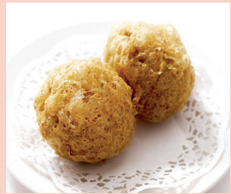
芋角 Yam Fritter