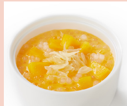
杨枝甘露 Mango w/ Pomelo & Sago