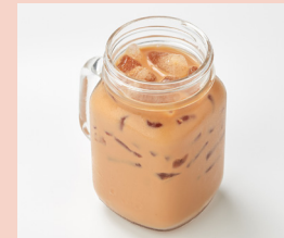
香港奶茶 Hong Kong Milk Tea