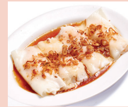
鲜虾肠粉 Rice Roll with Prawn