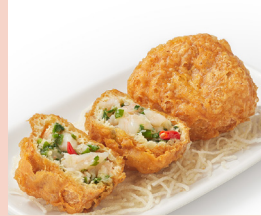
地雷豆腐 Tofu Bomb