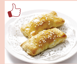
叉烧酥 Baked BBQ Pork Pastry