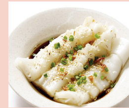
猪肠粉 Plain Chee Cheong Fun