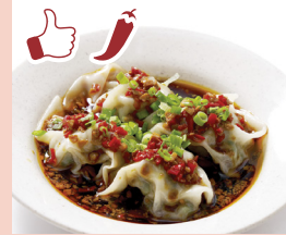
四川红油抄手 Sichuan Chilli Oil Wanton