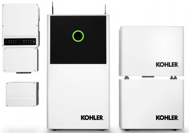
20 kWh Model