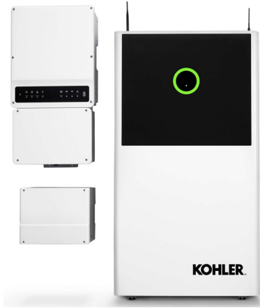
10 kWh Model