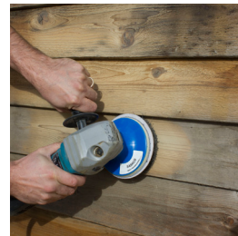
Buffy Pad System