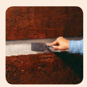
5. Tool to ensure a tight seal to the top and bottom of the chink line.