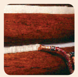
3. Gun Log Jam® over the backer rod.