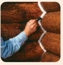
4. Tool to ensure a tight seal.