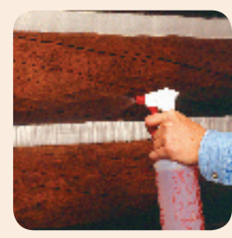
4. Lightly mist the Log Jam<sup>®</sup> as needed.