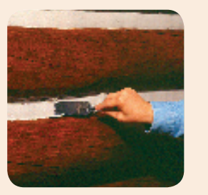
5. Tool to ensure a tight seal to the top and bottom of the chink line.