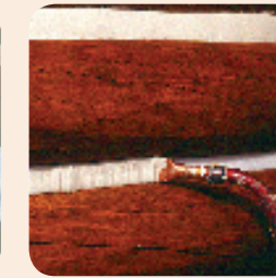
3. Gun Log Jam® over the backer rod.