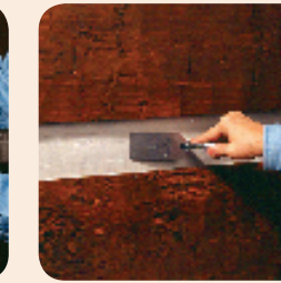
5. Tool to ensure a tight seal to the top and bottom of the chink line.