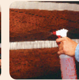
4. Lightly mist the Log Jam® as needed.