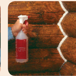
3. Lightly mist the Log Jam® as needed.