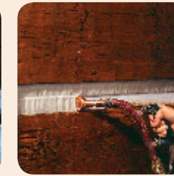
3. Gun Log Jam® over the backer material.