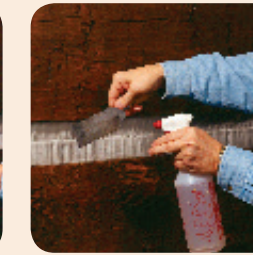
4. Lightly mist the trowel as needed.