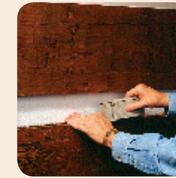
2. Tape the entire joint using polyester tape.