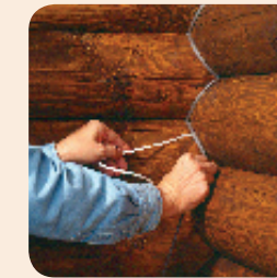
1. Install backer rod into corners of clean, stained logs.