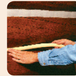
2. Or, install backer rod into caulk well of clean, stained logs.