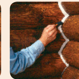
4. Tool to ensure a tight seal.

*NOTE: Use a bond breaker (e.g. backer rod) when significant log movement could occur. When movement is known to be minimal (as with many older homes) using backer rod is still best, but usually less critical.