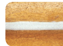
Log Jam® holds its seal.

You chose rugged, rustic logs and timbers to create your perfect homestead. Now, use Log Jam® to protect it for years to come. Log Jam® is the industry standard in synthetic chinking. Unlike old-time mortar or other synthetic chinking, it holds tough year after year. Its superior elasticity means it moves with your logs without cracking to seal your log cabin from vermin, pollen, dust, rain and wind alike. You get the rustic look of old-time mortar without compromising modern-day comfort and energy efficiency. Keep the cozy feel and rustic look of big timbers without compromise. Seal your logs with Log Jam®.