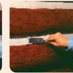
5. Tool to ensure a tight seal to the top and bottom of the chink line.