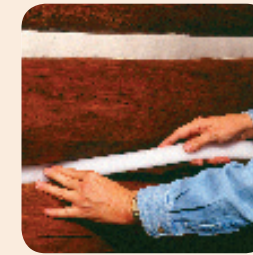
1. Install Grip Strip into caulk well of clean, stained logs.