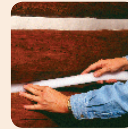
1. Start with logs that are stained with a coating compatible to Log Jam® and have properly installed backer material.