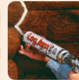
2. Gun Log Jam® over the backer rod.