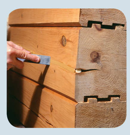
3 – Tool Conceal.

* NOTE: Use a bond breaker (i.e., backer rod) when significant log movement could occur. When movement is known to be minimal (as with many older homes) using backer rod is still best, but usually less critical.