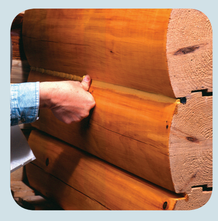
3 – Tool to ensure a tight seal to the top and bottom of the caulk line.