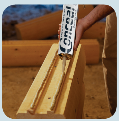
Apply bead(s) according to the log home manufacturer's instructions. Stack the next log and repeat. Don't allow caulk to skin over prior to stacking.