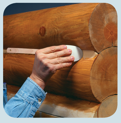
2 – Tool to ensure a tight seal to the top and bottom of the caulk line leaving at least 1/4" depth of caulk in the center of the joint.*