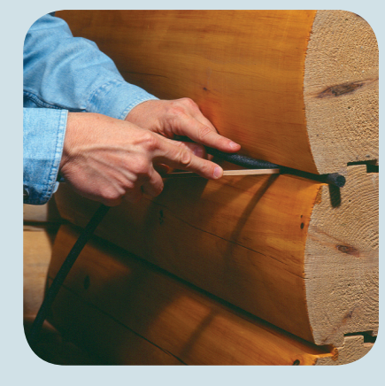
1 – Install backer rod into the caulk well of clean, stained logs.