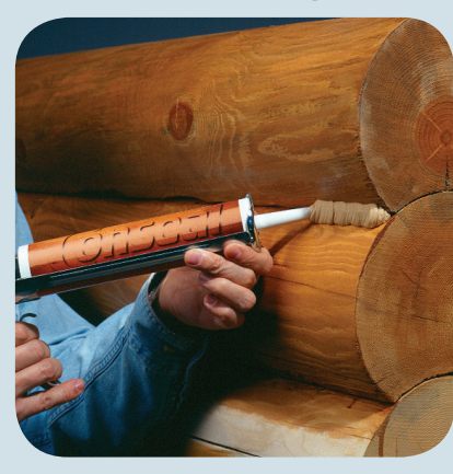
1 – Gun Conceal into clean, stained joints.