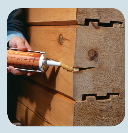
2 – Gun Conceal over the backer rod.