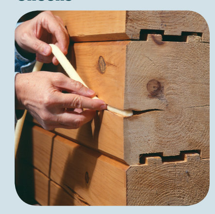
1 – Install backer rod into a clean, stained check to the appropriate depth. (See Fundamental Application Guidelines.)